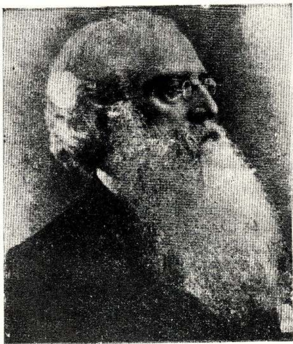
Henry Steel OLCOTT