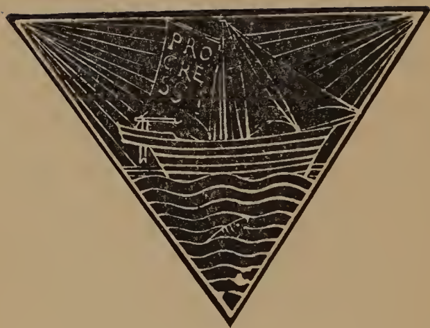
"Progress," by Eric Gill