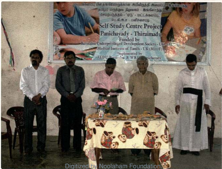
Digitized by Noolaham Foundation. noolaham.org | aavanaham.org