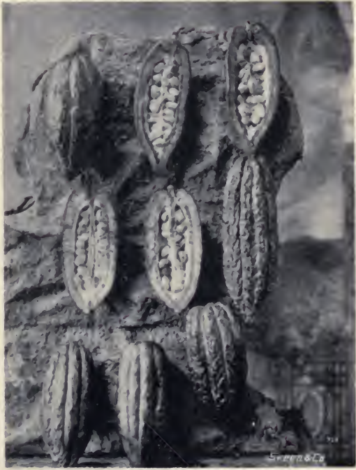
COCOA PODS CLOSED AND OPEN.

11 12 13 14 15 16 17 18 19 20 21 22 23 24 25 26 27 28 29 30 31 32 33 34 35 36 37 38 39 40 41 42 43 44 45 46 47 48 49 50 51 52 53 54 55 56 57 58 59 60 61 62 63 64 65 66 67 68 69 70 71 72 73 74 75 76 77 78 79 80 81 82 83 84 85 86 87 88 89 90 91 92 93 94 95 96 97 98 99 100