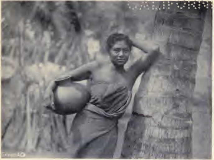
TAMIL COOLY GIRL.