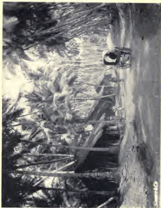
COUNTRY ROAD—WITH BULLOCK HACKERY. Plate XVI.