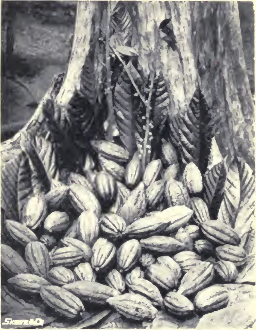
GROUP OF COCOA PODS AND BLOSSOMS