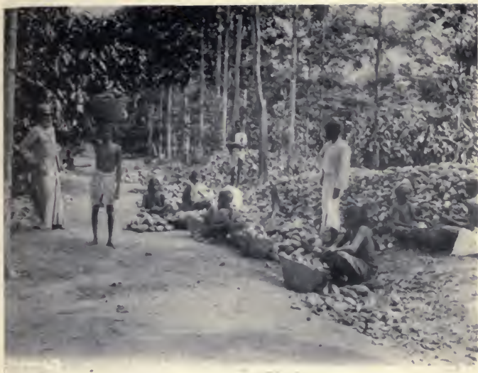
CUTTING THE PODS OPEN AND EXTRACTING THE BEANS.