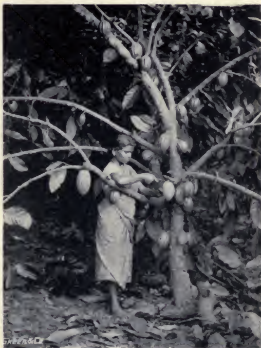
COOLY GIRL CUTTING OFF COCOA PODS.