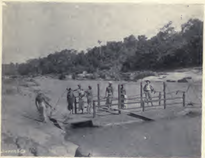
FERRY IN DUMBERA