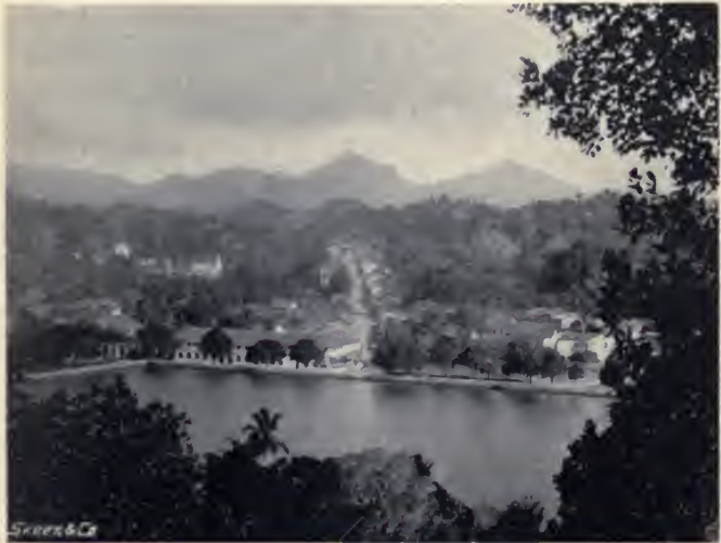
KANDY, WITH DISTANT VIEW OF THE MATALE HILLS. Plate VII.