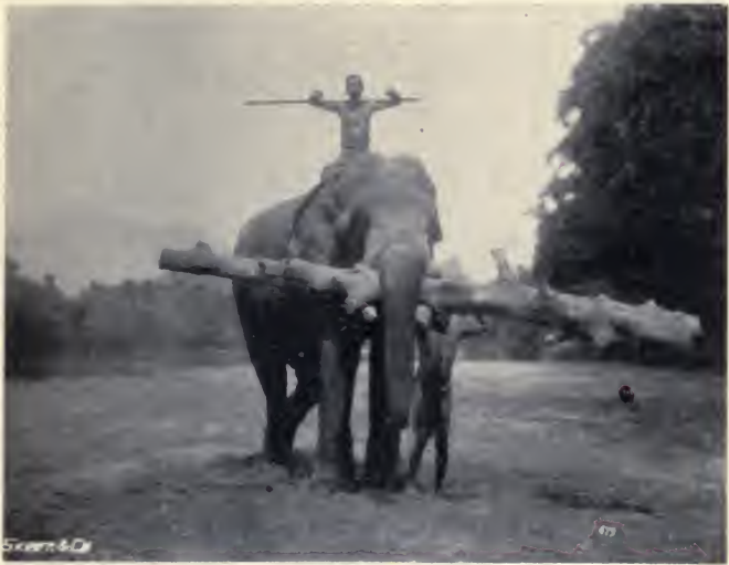
ELEPHANT AT WORK.