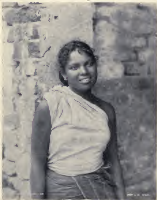
TAMIL WOMAN, CORYA CAST.