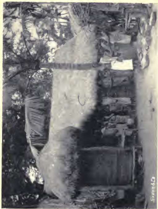
NATIVE HOUSE THATCHED WITH RICE STRAW.