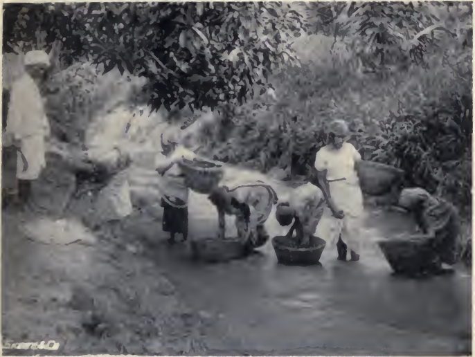
TAMIL COOLIES WASHING COCOA.