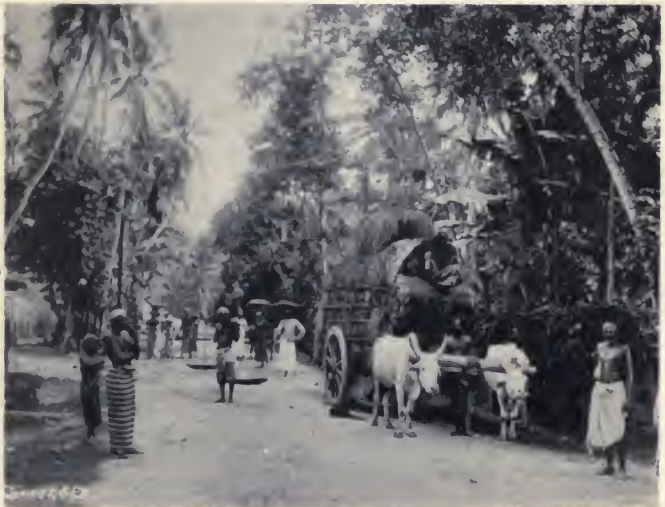
COUNTRY ROAD—BULLOCK CART AND NATIVES CARRYING PINGOS.