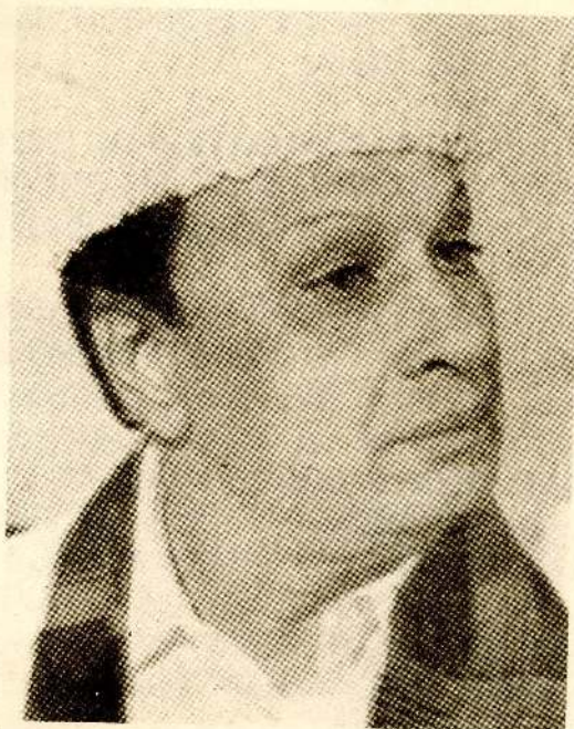
Mr. M. G. Ramachandran