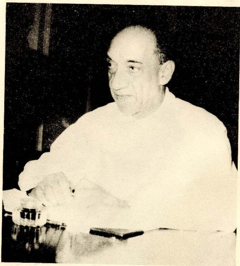
H.E the President J. R. Jayewardene

President Jayewardene in his message to the Indian Premier said, " Whilst sympathising with the families of all those who have died or have been injured as a result of this blast, it is clear that we who are committed to a democratic way of life and to a democratic process in finding solutions to problems must co-operate to fight terrorism which has become an ugly monster challenging the very foundations of the international community and its values. "