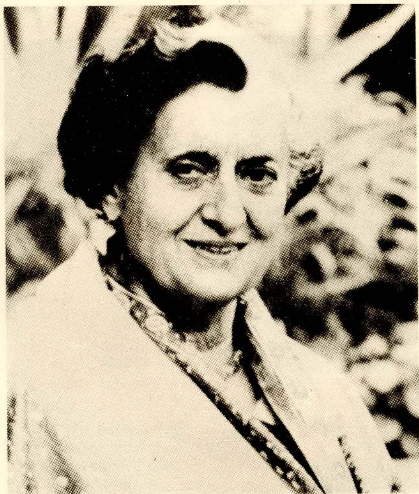
Srimathie Indira Gandhi

First to condemn the carnage was the Premier of India, Indira Gandhi. In a message to President J. R. Jayewardene, she said, "I condemn as much as you this outrage. Both our governments should take all steps to prevent the recurrence of all such forms of mindless violence. She asked the Lankan Head of State to convey her deepest sympathies to the families of the bereaved.