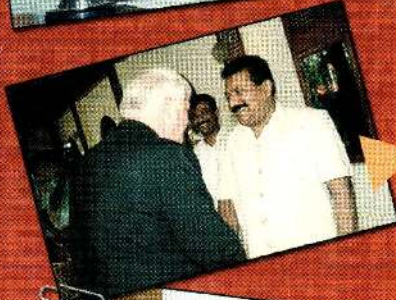
LTTE Leader with European Commissioner for External Relations 2003