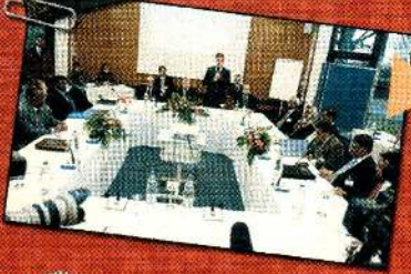
Geneva talks 2006