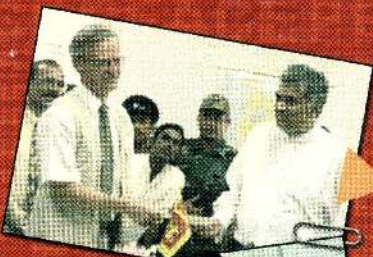
Cease-Fire Agreement 2002