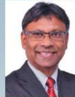
By Charles Devasagayam

The most talked about issue in the world now is the friction between Russia and Ukraine. Russia has been involved in war games at the Russia - Ukraine border and has amassed over 100,000 troops. Actions of Russian President Putin and American President Biden will determine the fate of not only Ukraine, but also the Europe. Tripple effects of a war will be felt throughout the world. The question now is will Russia invade Ukraine?