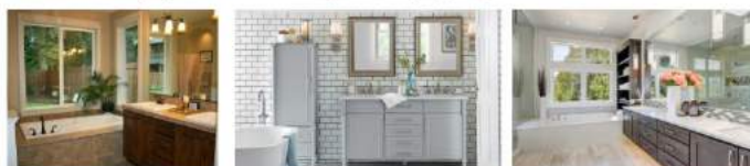
Real Estate page compiled by Charles Devasagayam