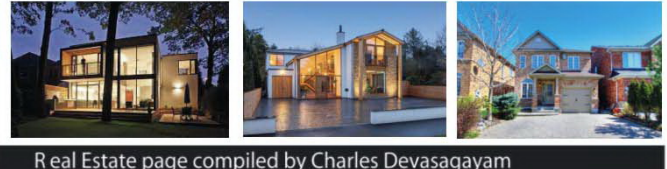
Real Estate page compiled by Charles Devasagayam