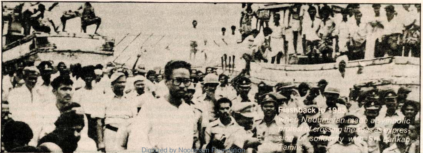
Flashback to 1983 when Nedumaran made a symbolic protest of crossing the seas as expression of solidarity with Sri Lankan Tamils.

The Government of India desirous as it is, of a negotiated settlement should realise how difficult such a task would be, as long as Lanka's terrorists continue to inspire Tamil Nadu's fanatics.