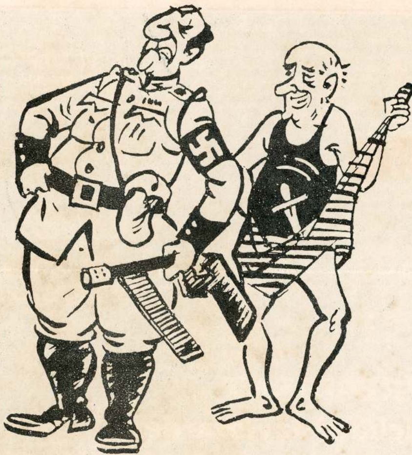
Jayewardene as seen by the Cartoonist of the Sinhala Communist Party paper – the ATHTHA

J unius Richard Jayewardene was independent Ceylon's first Finance Minister.