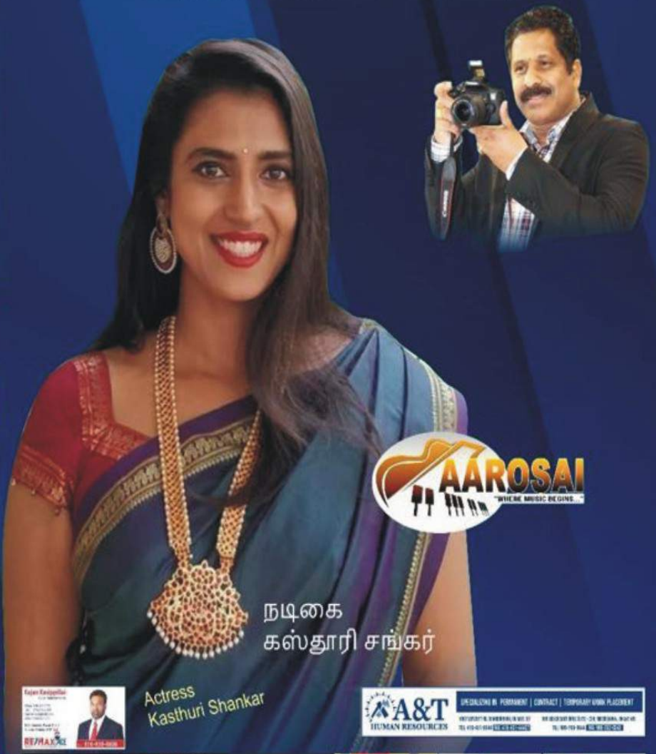
நடிகை கஸ்தூரி சங்கர்