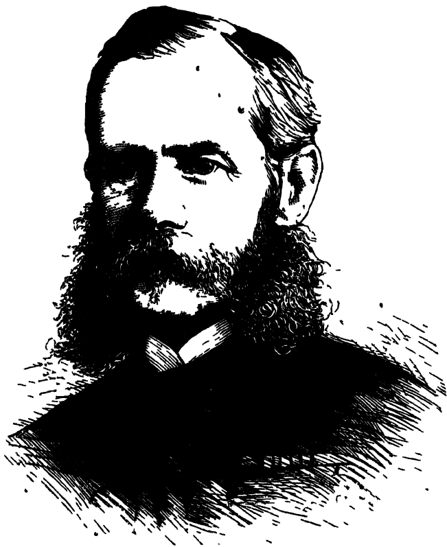
LIEUTENANT-GENERAL SIR FREDERICK ROBERTS, BART., G.C.B., ETC.

safely, I suppose we shall follow with the convoy of sick and wounded. I went over to General Roberts's quarters, and was very kindly received. The General's room is of the plainest