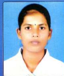
B.KIRIJA J/Chavakacheri Hindu College U/20 Girls, Pole Vault 2.85m