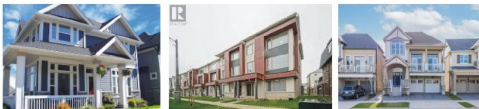
Real Estate page compiled by Charles Devasagayam