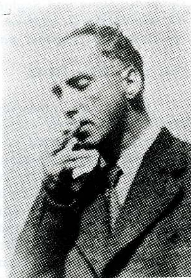
Kurt Huber, born 24.10.1893, arrested 27.2.1943, executed 13.7.1943