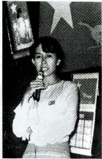
Aung San Suu Kyi One of the thousand public addresses given in 1988-9

Aung San Suu Kyi was awarded the Nobel Peace Prize for 1991. She has never been able to receive it. She has been under house arrest by order of her country's military rulers since 1989. Aung San Suu Kyi is the former leader of the National League for Democracy in Myanmar, previously known as Burma. She was elected to power in 1988 in a landslide popular vote, but was never able to take office because the military intervened, nullifying the results of the election and imposing rule by junta on the country.