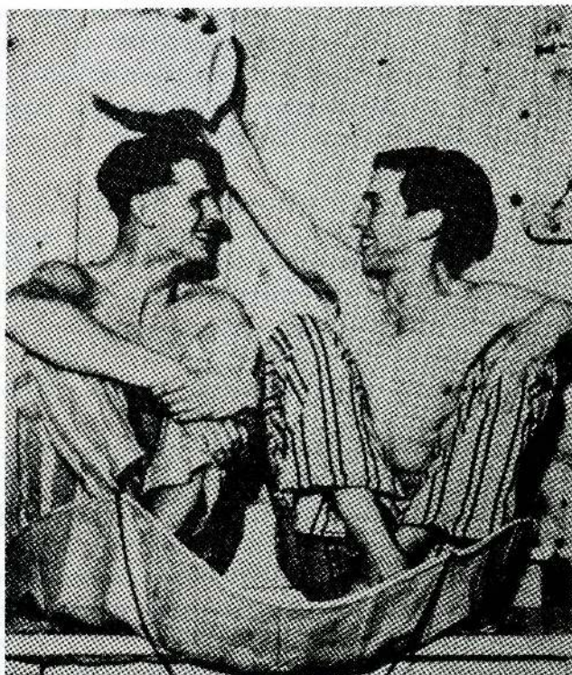
A friendship dating back to schooldays. Christoph Probst, born 6.11.1919, arrested 19.2.1943, executed 22.2.1943, and Alexander Schmorell, born 16.9.1917, arrested 24.2.1943, executed 13.7.1943

was that it gave the appearance of having to oppose its own state, its people, and that people's interests. For many, this entailed a difficult conflict, through which they struggled with difficulty. But not so for my brother and sister; for them no dilemma existed... The defence of common humanity everywhere had to be raised above the interest of the nation... In a war against the individual, against people different from ourselves, and against dissident minorities, the resisters had to show their solidarity with these isolated individuals.