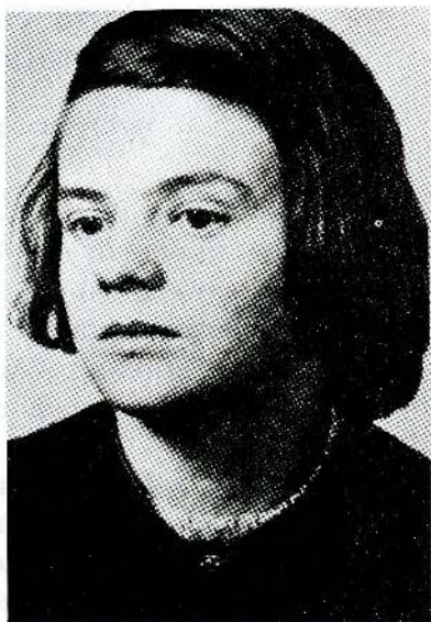
Sophie Scholl, born 9.5.1921, arrested 18.2.1943, executed 22.2.1943