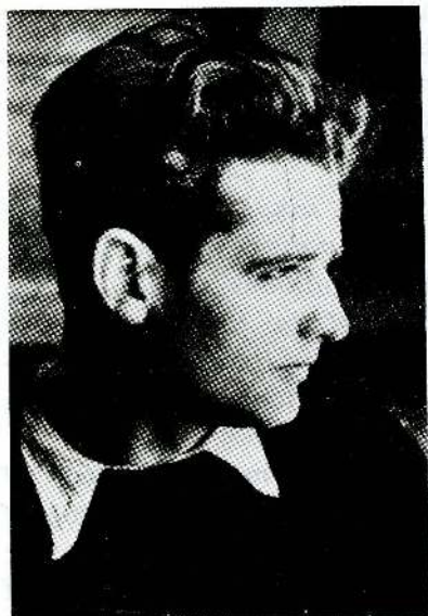
Hans Scholl, born 22.9.1919, arrested 18.2.1943, executed 22.2.1943