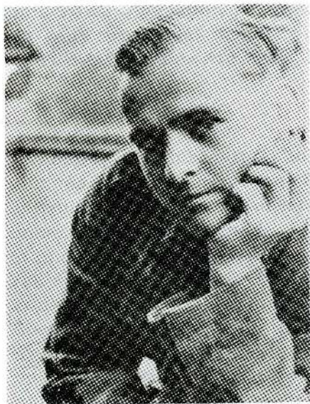
Willi Graf, born 2.1.1918, arrested 18.2.1943, executed 12.10.1943