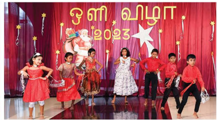
Oli Vizha – Divine Mercy Shrine – Alles Garden – 15.12.2023