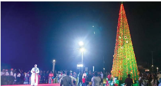
Grand Opening of the Christmas Tree, Trinco Beach – 24.12.2023