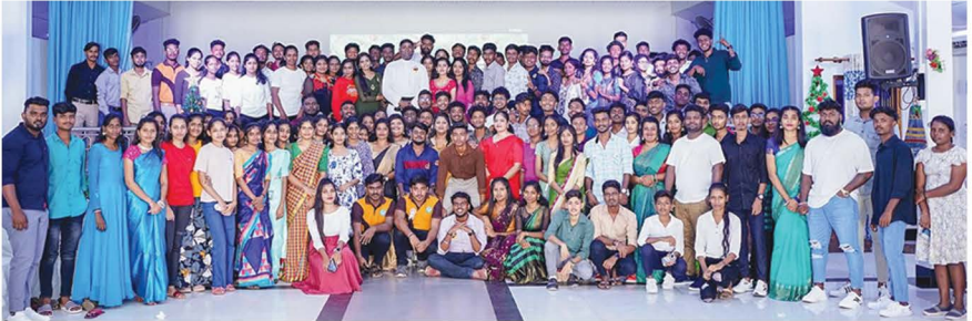
Oli Vizha – Catholic Youth Federation – Trincomalee Diocese – 30.12.2023