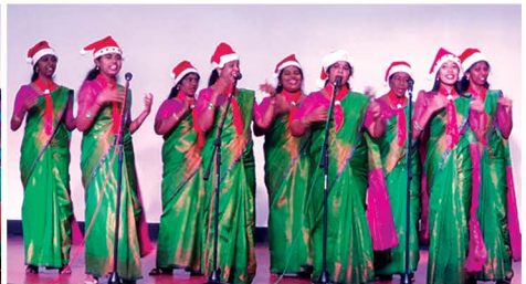
Oli Vizha - Diocesan Catechism Teachers - 16.12.2023