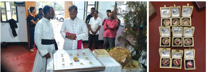
Relics of Nine Saints at Guadalupe Church – 04.01.2024