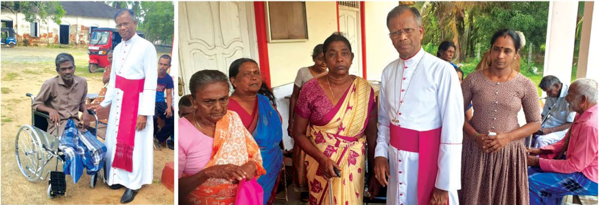
Assistance to the needy – 30.12.2023