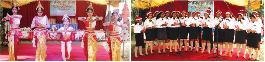
Christmas Carols, Kantalawa Parish – 27.12.2023