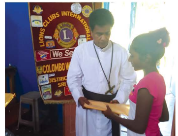
Lions Club International – Colombo Wattala at Kuchchaveli Parish – 24.12.2023