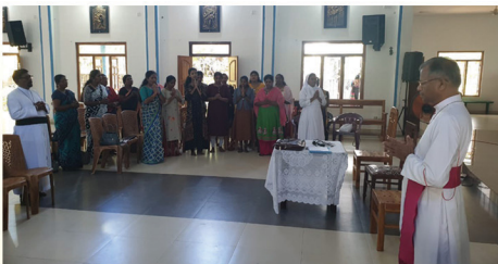
Meeting with the Lay Members of the Parish - Anpuvelipuram - 25.02.2024