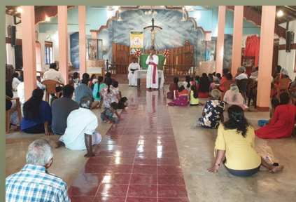
Meeting with the Lay Members of the Parish – Kumpurupity – 11.02.2024