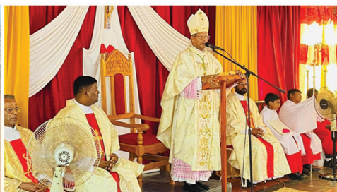
Feast of the Infant Jesus Church, Orr's Hill – 04.02.2024