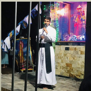
Opening of the reconstructed Altar of Our Lady of Velankanni, Andankulam – 13.02.2024