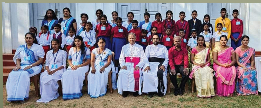
Badge Ceremony of Kantalawa Parish - 03.03.2024