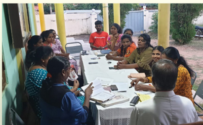
Meeting with the Catechists of the Parish - Linganagar - 23.02.2024