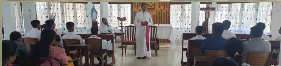
Reinstallation of the Minor Seminary to its original place - 01.02.2024