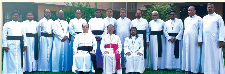
Annual Retreat of Priests – Monte Fano, Kandy, 4 – 9 February 2024