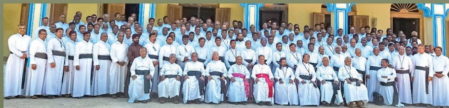
North East Priests' Lenten Gathering at Madhu Shrine - 04.03.2024