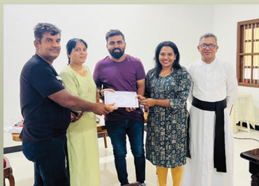
Marriage Preparatory Class, Uppuveli - 02.03.2024