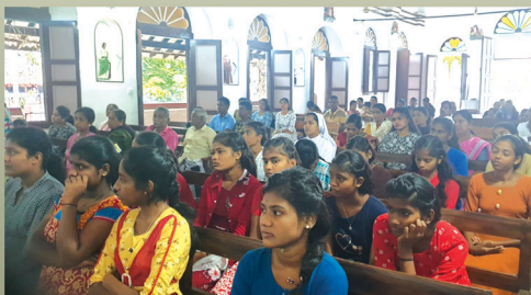
Meeting with the Lay Members of the Parish – Nilaveli – 11.02.2024