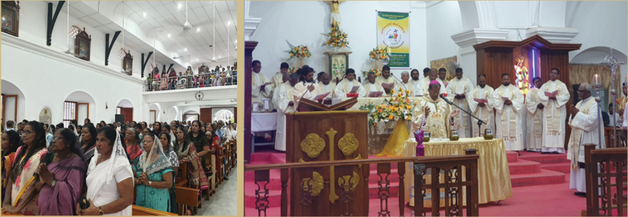
Blessing of the Holy Oils – Chrism Mass, Cathedral – 25.03.2024