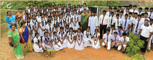
Tree Planting campaign