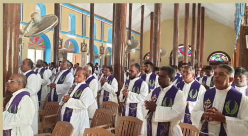
North - East Priests' Lenten gathering - Madhu Shrine - 04.03.2024