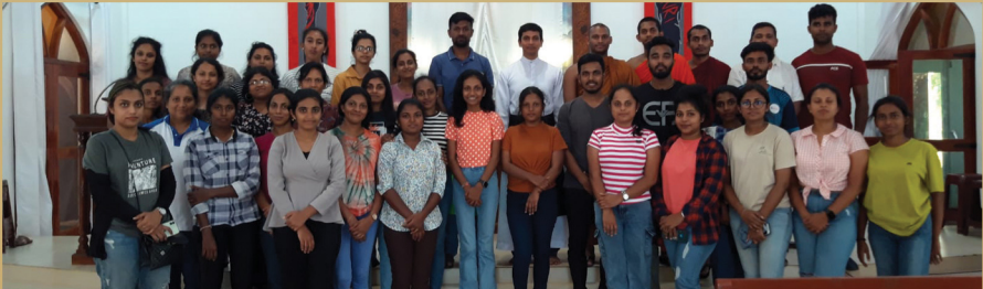
Visit of Students & Lecturers from the Department of Philosophy, Peradeniyai University to Andankulam Church – 30.03.2024