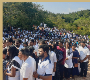
Diocesan Way of the Cross - Nachchikudah (China-Bay) - 16.03.2024