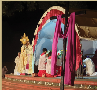
Diocesan Lenten Prayer Service - Palaiyoothu - 09.03.2024