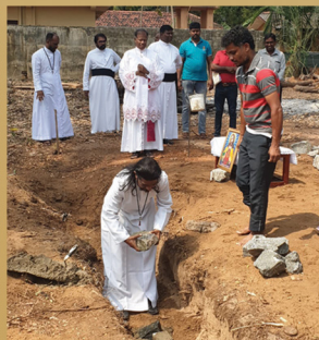
Laying of foundation stone for Home for Senior Priests - 19.03.2024