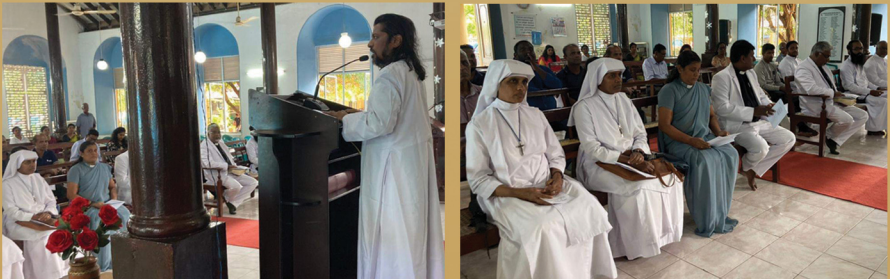
Unity Octave Programme – Caritas-EHED, Trincomalee