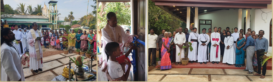
Blessing and opening of Parish House – Langanagar – 19.03.2024