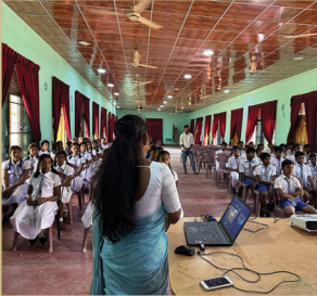
Sustainable Agricultural Techniques Seminar