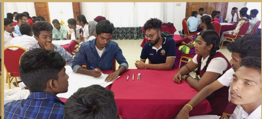
Peace Building Programme

PRIVATE CIRCULATION ONLY EDITED & PRINTED BY: REV. FR. A. A. NAVARETNAM (NAVAJI) DIOCESE OF TRINCOMALEE CELL: 077 237 55 28 / EMAIL: FRNAVAGI@GMAIL.COM