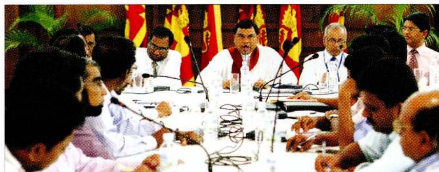
Minister Basil Rajapaksa in discussion with members of the media

Basil Rajapaksa, Minister of Economic Development, chaired the Gampaha District Development Committee meeting. The Minister reviewed the progress of the decisions taken by the previous meeting with parliamentarians, local government representatives and government officials. Minister instructed the officials to finish the renovation work of the Child and Maternity clinics in the district and construction work of the international football ground.