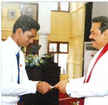
President Mahinda Rajapaksa and First Lady Shiranthi Rajapaksa distributing prizes to the students

This is a voyage of discovery in which, on every day in school, the student would learn something new to deepen his understanding, sharpen his instincts and broaden his horizons. It is a journey in the course of