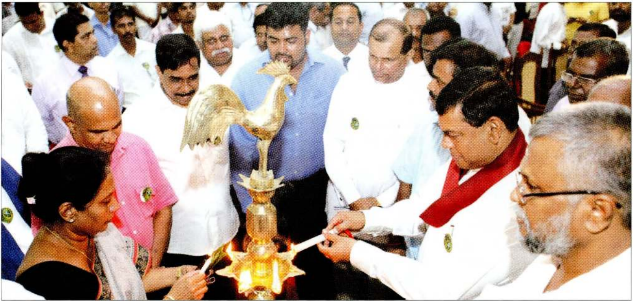
Minister Basil Rajapaksa lighting the oil lamp. Douglas Devananda, Minister of Traditional Industries and Small Enterprises is also present in the picture.