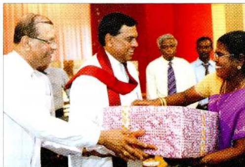
Presenting a Personal Computer to a School Principal