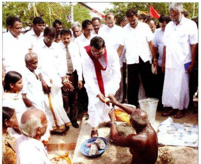
Minister Rajapaksa overseeing the start of the construction work

B asil Rajapaksa, Minister of Economic Development commenced the work of construction of a market at Muruthankerny in Point Pedro. The estimated cost of the project is Rs 4,636,882,60.