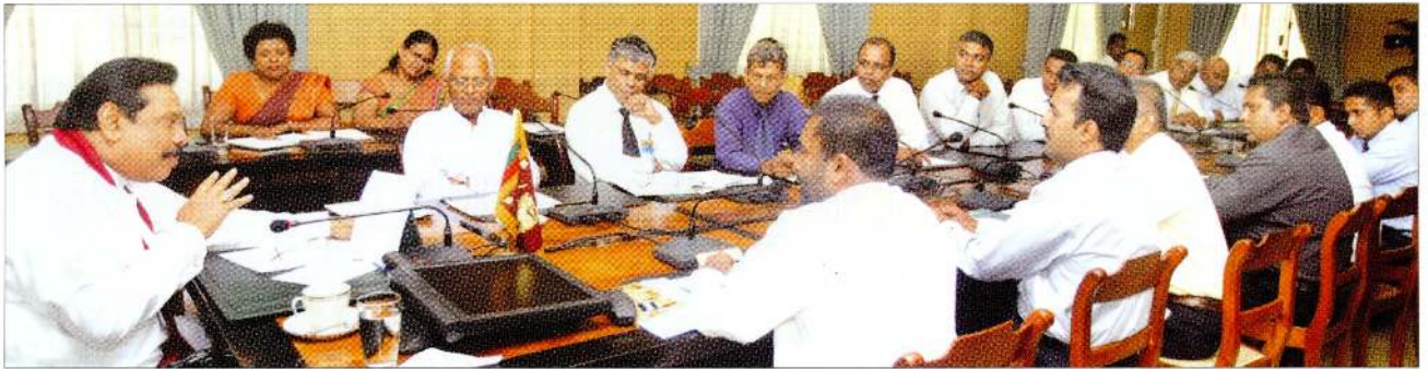
President Rajapaksa meeting with SLFP graduates' union office bearers