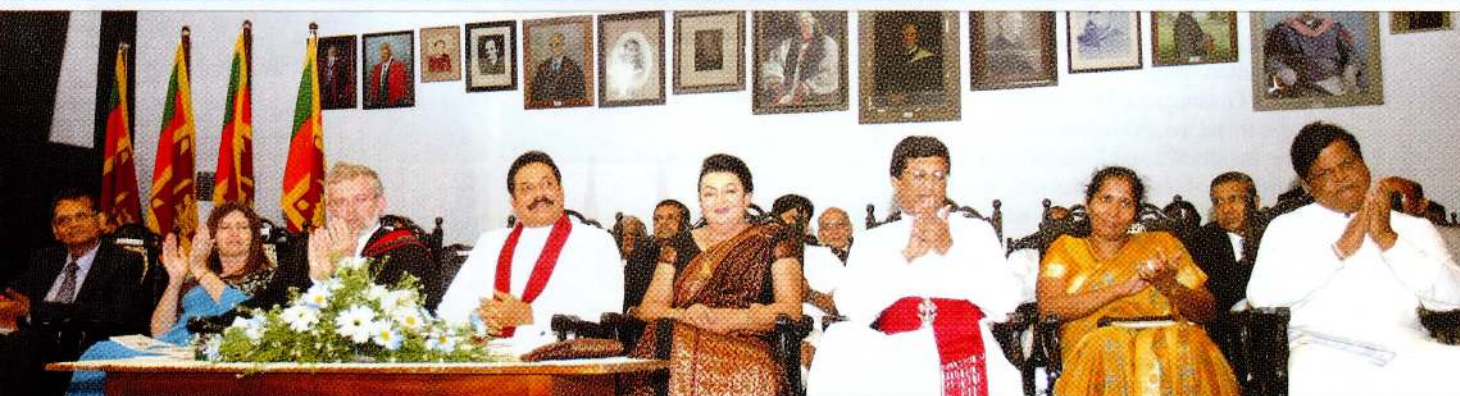
President Mahinda Rajapaksa and First Lady Shiranthi Rajapaksa at the prize giving of St Thomas' College, along with other distinguished invitees

The annual prize giving of S Thomas' College, Mount Lavinia was held under the patronage of President Mahinda Rajapaksa. At this event President Rajapaksa distributed awards to high achieving students of the school and addressed some words of advice to the students. Speaking at the occasion President Rajapaksa pointed out that although the world is rapidly becoming a global village, the natural instinct in everyone is to search for their cultural roots. This was, in essence a hunt for security in the midst of uncertainty and instability, the President noted. The President also focused on the need to impart an education that is holistic in nature, and encompasses not only academic achievement but sports, extra curricular activities and cultural activities as well.