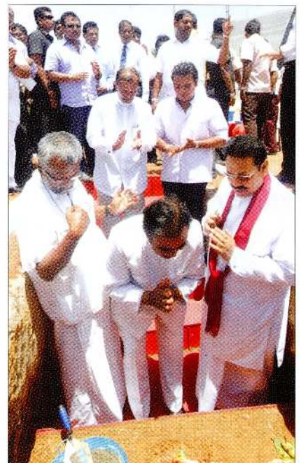
President Mahinda Rajapaksa and the other distinguished invitees at the ceremony to lay the foundation stone