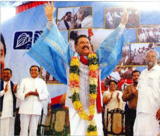
President Rajapaksa at the public rally at Chavakachcheri