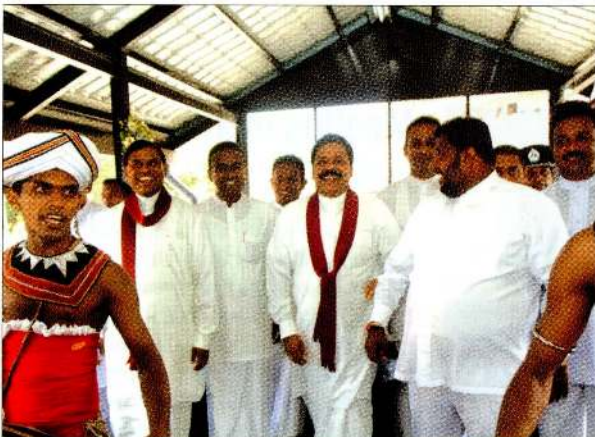
Inside the new bus stand

P resident Mahinda Rajapaksa declared open the newly constructed bus stand in Galle. Rs 405 million was spent on the construction of the bus stand. Basil Rajapaksa, Minister of Economic Development and Minister Johnston Fernando accompanied the President.