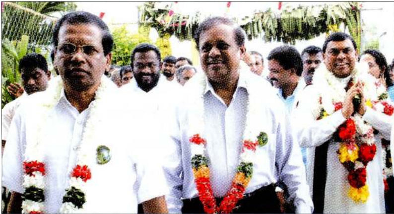
Minister Basil Rajapaksa, Minister Susil Premajayantha and Minister Maithreepala Sirisena