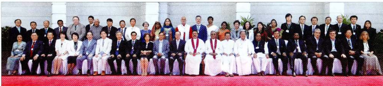
Representatives of the session with the President