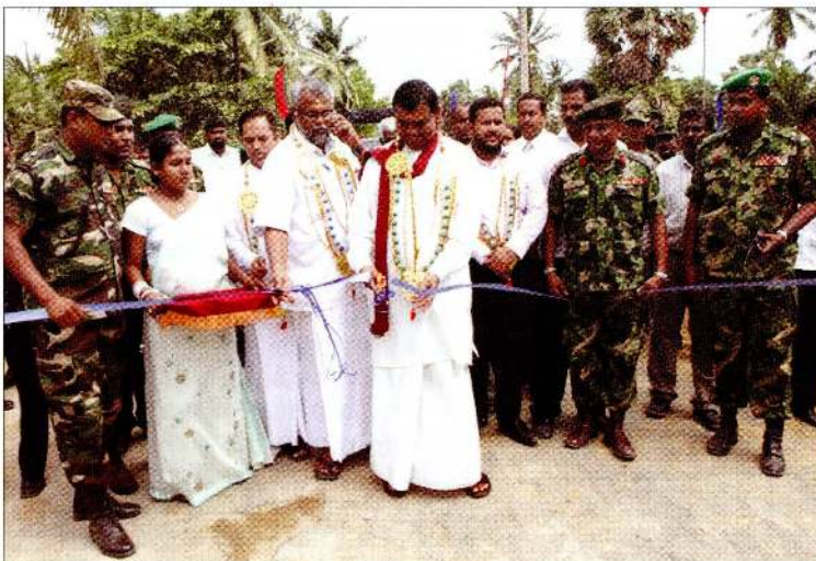
Minister Basil Rajapaksa declaring open the road

Minister Basil Rajapaksa presided over a ceremony at the Varani junction to mark the opening of Kodikaman – Point Pedro road after 11 years. A part of this road was closed for the past 11 years due to security reasons.