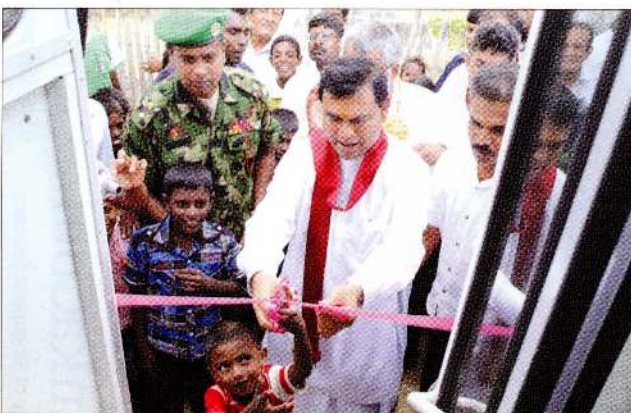
Minister Basil Rajapaksa at the inauguration of the new bus service