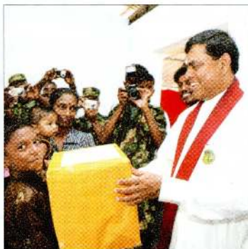
Handing over a gift