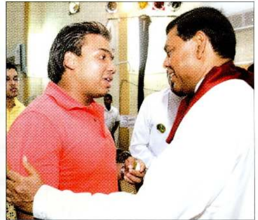
Minister Basil Rajapaksa with Namal Rajapaksa, MP