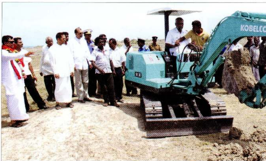
Minister Basil Rajapaksa visiting Delft island, overseeing development activities and interacting with members of the public

D elft, an island situated 46 km away from the Jaffna mainland was visited by a government minister for the first time after 21 years when Minister