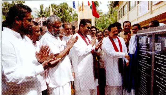
President Rajapaksa visiting the Navalar Tamil Maha Vidyalaya in Kopai to declare open "Uva - Uthuru Friendship Hall"