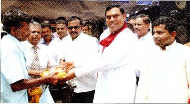
Minister Basil Rajapaksa handing over a water pump to a farmer while Sivaneshathurai Chandrakanthan, Chief Minister of the Eastern Province and Vinayagamoorthy Muralitharan, Deputy Minister of Resettlement look on.

B asil Rajapaksa, Minister of Economic Development was the Chief Guest at the inauguration ceremony of the rehabilitation of the Meyangamkulam Tank in the Koralaipattu South, Kiran Divisional Secretariat in the Batticaloa District. Vinayagamoorthy Muralitharan, Deputy Minister of Resettlement and Sivaneshathurai Chandrakanthan, Chief Minister of Eastern Province were also present at the occasion.