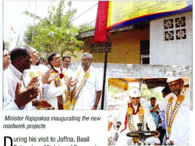
Minister Rajapaksa inaugurating the new roadwork projects

During his visit to Jaffna, Basil Rajapaksa, Minister of Economic Development inaugurated 33 development projects within the Jaffna Municipal Council limits. As the first project the Minister inaugurated the carpeting of Kovil street in the Nallur District Secretariat division. All projects implemented in the resettled areas are combined three in one projects that include road development, water supply and rural electrification schemes.