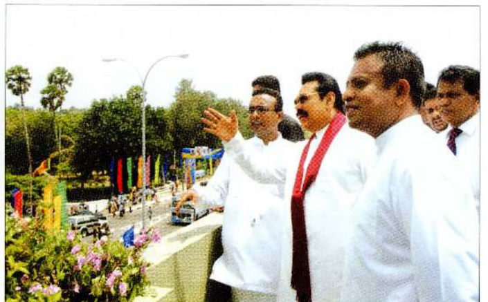
President Mahinda Rajapaksa with other guests during the opening ceremony