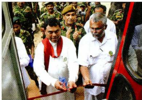
Inaugurating a bus service for the people of Jaffna