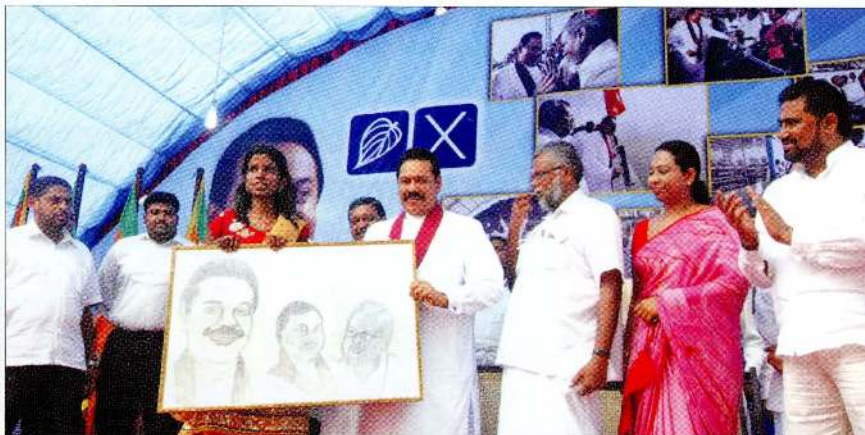
President Rajapaksa participating at the public rally at Kopai

President Mahinda Rajapaksa conducted a three day visit to the North. During his stay the President visited Kayts, Kopai, Poonaryn, Chavakachcheri, Jaffna and Kilinochchi.