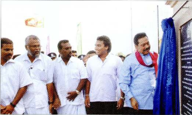
President Rajapaksa unveiling the memorial plaque at the Kilinochchi sports complex