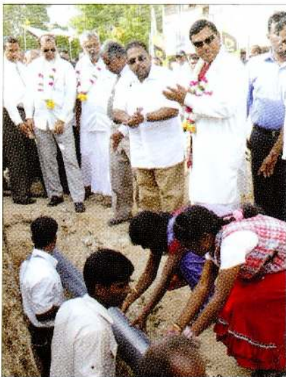
Minister Basil Rajapaksa inaugurating development projects during his visit to Valvettithurai

T he people of Valvettithurai in the Valikamam west in northern Jaffna were empowered with several facilities.