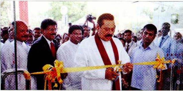
President declaring open the Vilgamuwa People's Bank branch