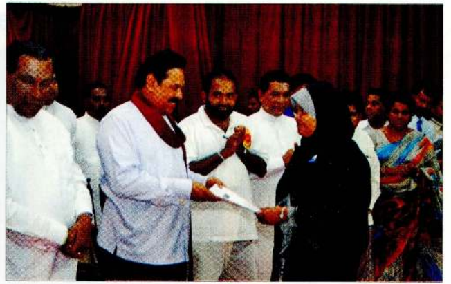
Trainee graduates being given permanent Government appointments

Under the Deyata Kirula development programme in the East the new People's Bank joins the banking sector as the head office in the Ampara district with its ultra modern auditorium and as the small and medium lending centre.