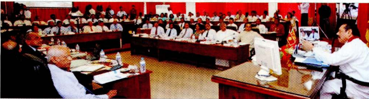
President speaking to Officials of the Ministry of Lands and Land Development