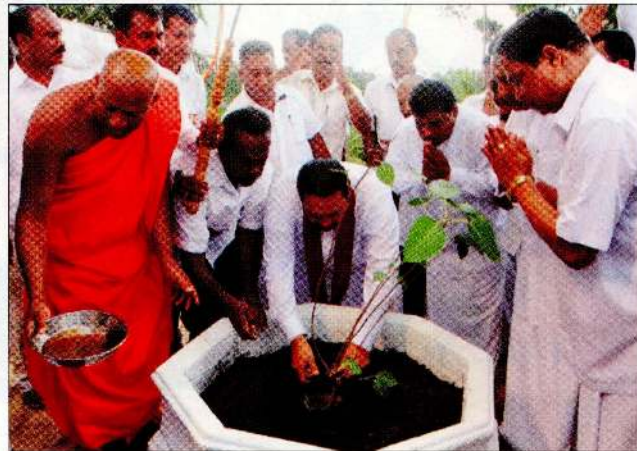
President planting a Bodhi tree at the Sapugoda Viharaya in Beruwela

President Mahinda Rajapaksa declared open the new Sangawasa building and the surrounding wall of the Bodhi Tree at the 93 year old Kalutara, Beruwela Sapugoda Viharaya.