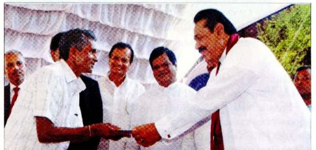
1000 farmers in the district received loan facilities from People's Bank to obtain farming utensils