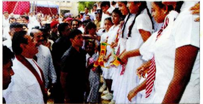
President talking to students of the school