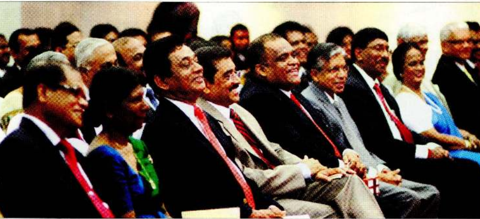
Invitees at the event