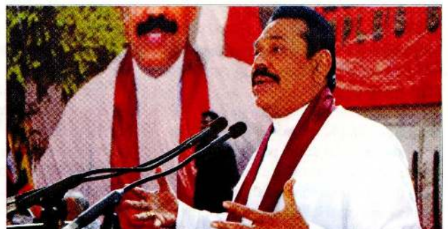
President addressing the gathering