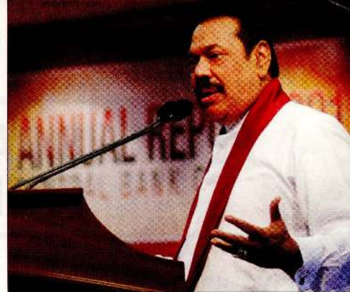
President addressing the gathering