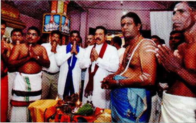
President receiving blessings at the Kovil