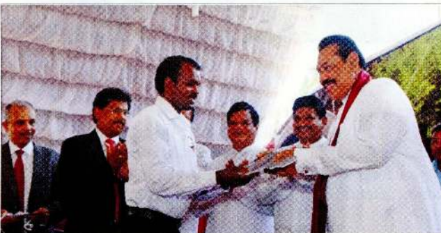
The people of the district receiving loan facilities from the President