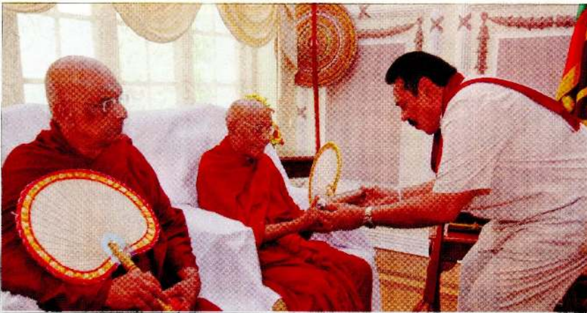
President presenting the Sannaspathra to the Maha Sangha

The Sannas Pathra presentation by President Mahinda Rajapaksa for awarding elephants to temples was observed at Temple Trees.