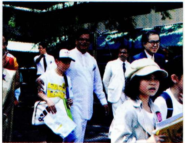
Minister Bandula Gunawardana with children of the Asia Pacific Children's Convention Mission Project

"Japan helps Sri Lanka to stand strong in the world stage," said Education Minister Bandula Gunawardana addressing the inauguration of the Asia Pacific Children's Convention Mission Project 2013, at Sirimavo Bandaranaike Balika Vidyalaya.