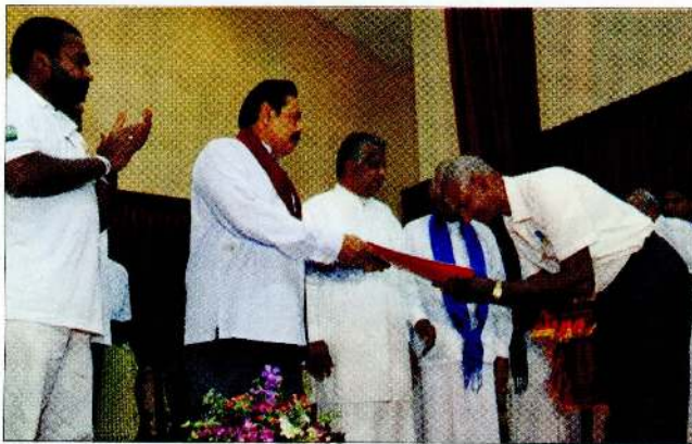
Ranbima title deeds being handed over by President

President Rajapaksa advised the appointees to keep going forward, to sit for exams, join the civil service, join the administrative service, sit for competitive