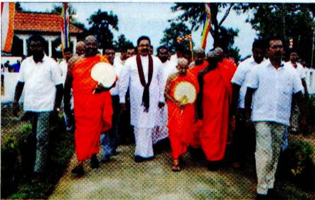
President visiting Arantalawa