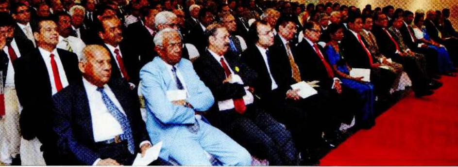
Invitees at the event