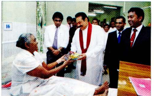
President visiting a patient at the hospital in Ampara