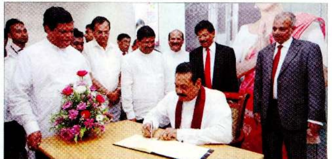
The first deposit for the bank was accepted by the President