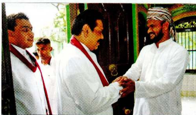
President visiting the Kataragama Mosque as Namal Rajapaksa MP looks on

President Mahinda Rajapaksa visited the Muslim Mosque in Kataragama and received blessings.