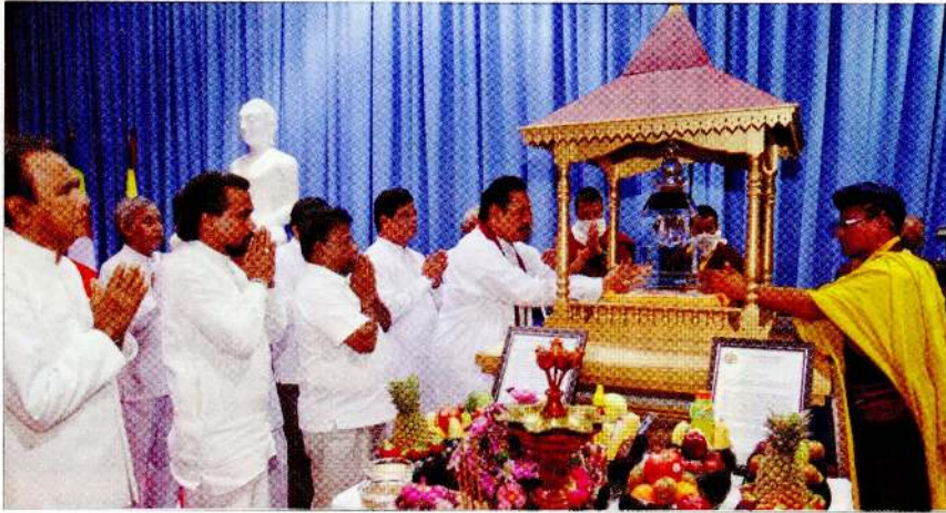
Relics of Lord Buddha being gifted to Sri Lanka

The Gyalwang Drupka, spiritual head of the Drupka Order of Tibetan Buddhism, presented President Mahinda Rajapaksa with a bone Relic of the Buddha as a gift to Sri Lanka. "We now leave in your devotional hands one of our most priceless treasures,"