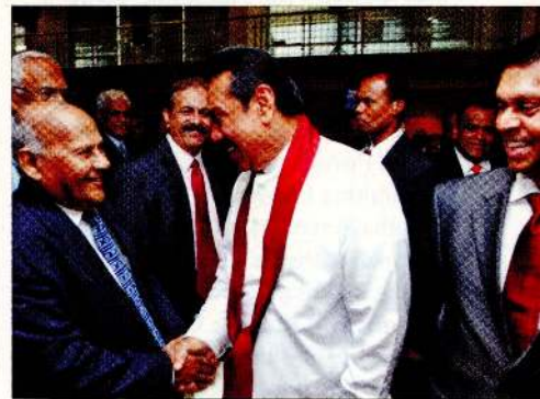
President speaking to some of the dignitaries

to gain benefits from them. There were many obstacles that came along. Coal Power Plants, Hydro Power Plants, Irrigation and Road construction work are being finalized now. Huge development projects such as Mattala International Airport, Hambantota Port and the Southern Highway were handed over to the people. Remote and far off places are being developed. Colombo port and the Colombo - Katunayake highway will soon be handed over to the people. Some can't see these developments. Even if they see them, they pretend that they didn't. Agriculture, fisheries industry, small and medium scale industries and people's main needs such as housing, drinking water, electricity, health, schooling and education and banking services are being invested in heavily and many ongoing projects are currently happening.