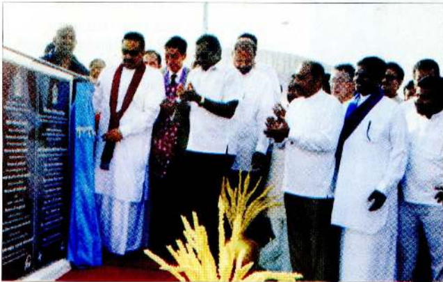
President declaring open the Kallady bridge