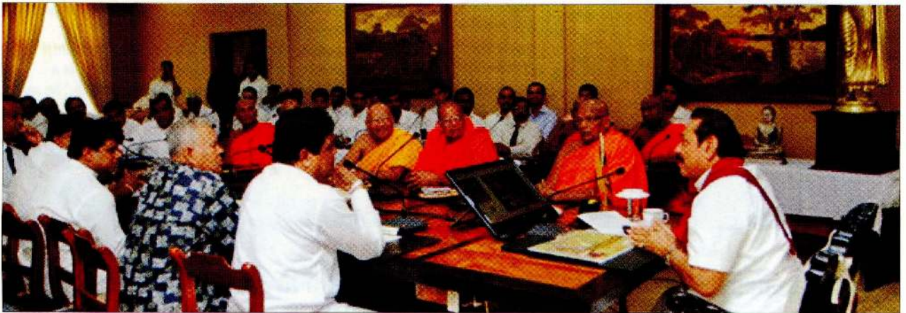
President at discussions with the Maha Sangha on erecting the largest Buddha Statue in Asia

Discussions were conducted under the patronage of President Mahinda Rajapaksa at Temple Trees to construct the largest standing Buddha Statue in