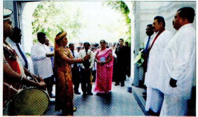
Avurudu Nekath Seettuwa was handed over to President Mahinda Rajapaksa

The Avurudu Nekath Seettuwa was handed over to President Mahinda Rajapaksa by the Ministry of Cultural Affairs in a traditional ceremony at the Temple Trees.