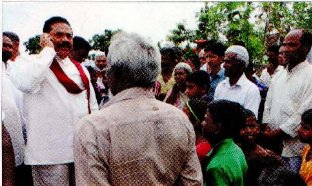
President with the people of Poththuvil

The people of all three nationalities put forward their grievances to the President at the 5th Mile Post, Sengamuva, Poththuvil.