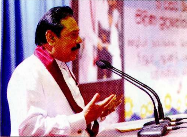
President speaking at the scholarship awarding ceremony

A ceremony to grant scholarships to students who excelled in the A grade five scholarship exam in 2012 was held at Temple Trees under the patronage of President Mahinda Rajapaksa.