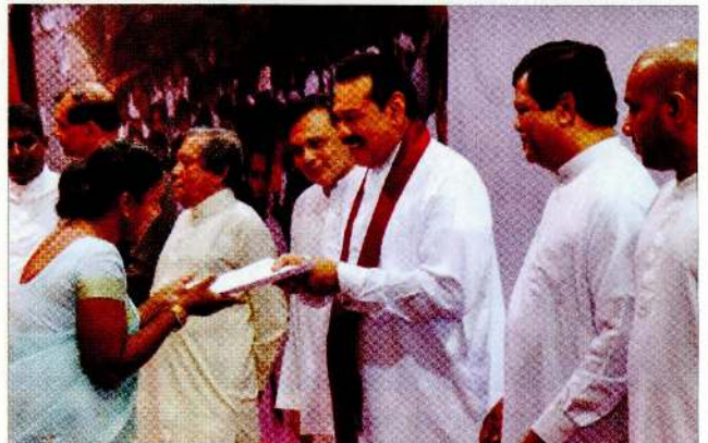
President presents appointment letters

President Mahinda Rajapaksa presented letters of appointments to 2,460 National Science Diploma Holders from 18 colleges of education at Temple Trees.