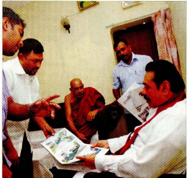
President at discussion of the development plans for ancient Wewurukannala Raja Maha Viharaya