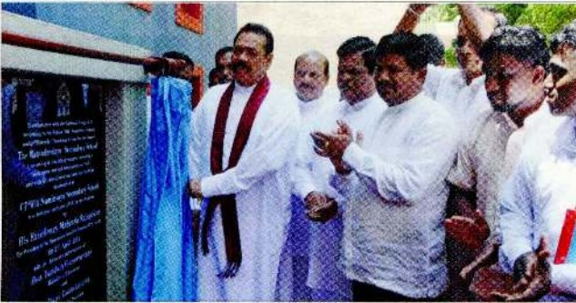
President declaring open the new school building