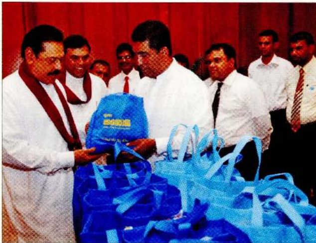
President presented with the first budget pack from CWE

The CWE following President Mahinda Rajapaksa's advise and maintaining a stable price for essential goods during the festive season, introduced a special budget pack of essential items. The first budget pack was presented to the President at the Presidential Secretariat by Johnston Fernando, Minister of Co-operatives and Internal Trade.