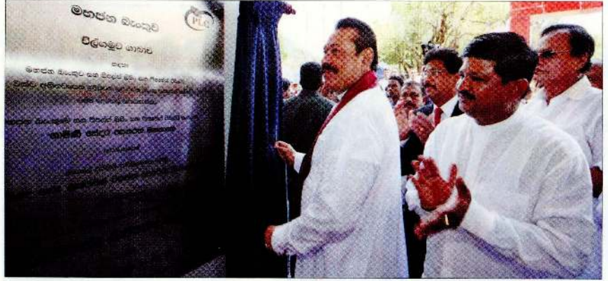
Opening the building complex of the People's Bank in Vilgamuwa