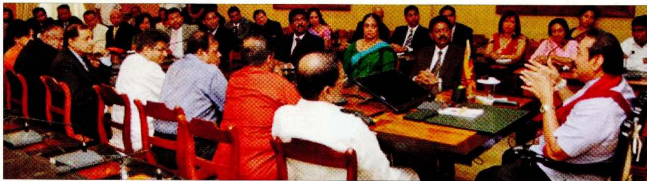
President in discussion with Sri Lankan expatriates in America

P resident Mahinda Rajapaksa stated that he expected all Sri Lankans living overseas to gather together in showing their support to win obstacles faced by the country. The American expatriates thanked