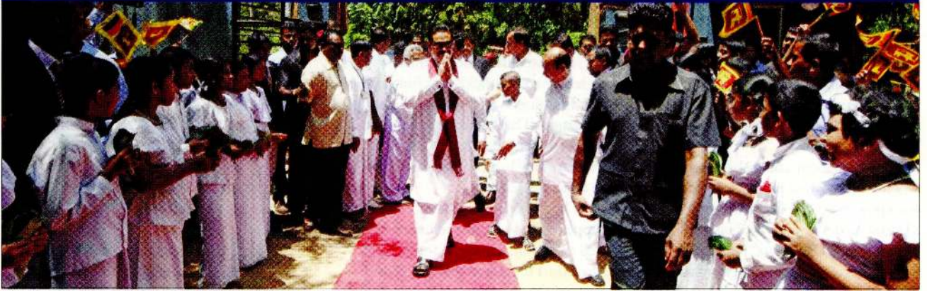
President arriving at the Vilgamuwa Naminioya Secondary School