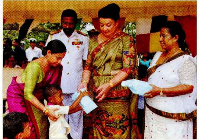
First Lady handing over gifts to children at the Welisara Naval Pre School

The Avurudu Programme of the Welisara Naval Pre School was held at the Naval Head Quarters with First Lady Shiranathi Rajapaksa as the Chief Guest.