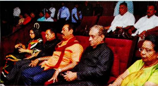
President viewing the musical event at film star Vijaya Kumaratunga's twenty fifth commemoration

A commemoration musical event was held at the Nelum Pokuna Mahinda Rajapaksa Theatre to mark the 25th death anniversary of popular film actor, humanitarian activist and politician Vijaya Kumaratunga.