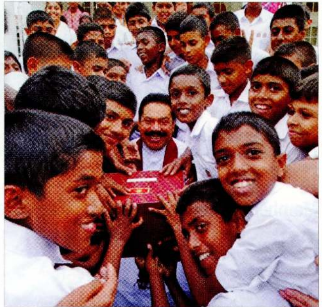
Students of Zahira College with the President

Children from Gampola Zahira College visited Temple Trees which is a favourite educational tour place among school children.