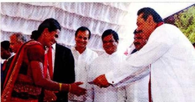
The people of the district receiving loan facilities from the President