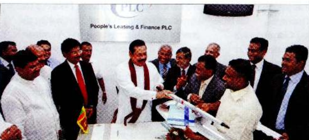
People's Leasing branch being opened by the President and the first loan being given to the first customer to purchase a bus