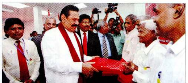
The long standing and front row customers of the bank receiving mementos from the President