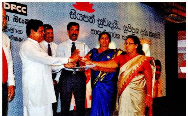
Productivity awards being presented by Minister Bandula Gunawardana

Going beyond the Japanese 5S concept and adding a sixth component of 'safety' to it, 100 schools were awarded productivity awards under the patronage of Bandula Gunawardana, Minister of Education at the Cinnamon Grand hotel in Colombo.