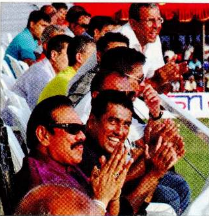
President enjoying the game