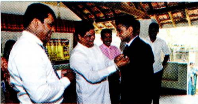
Minister Bandula Gunawardana presenting prefects with badges

The ceremony to appreciate teachers and present prefect positions to the elected prefects at Bope Rajasinghe Vidyalaya was held under the auspices of Bandula Gunawardana, Minister of Education at the school premises.