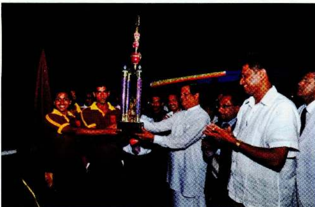
Minister Bandula Gunawardana at the sports festival of Rajasinghe Madya Maha Vidyalyaya in Hanwella in the Homagama

Minister Bandula Gunawardana says that from next school term, it will be made compulsory for all school children to engage in a 10 minute PT session in the morning after religious activities before they start school work. This will lead to a healthy generation of children in the country.