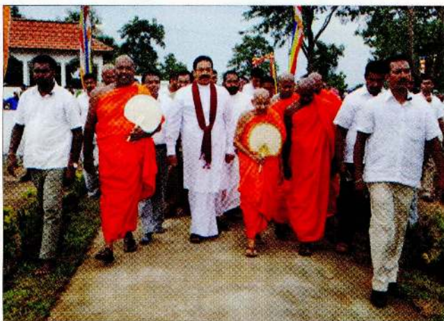
President at the commemoration of Bhikkus who lost their lives in Aranthalawa