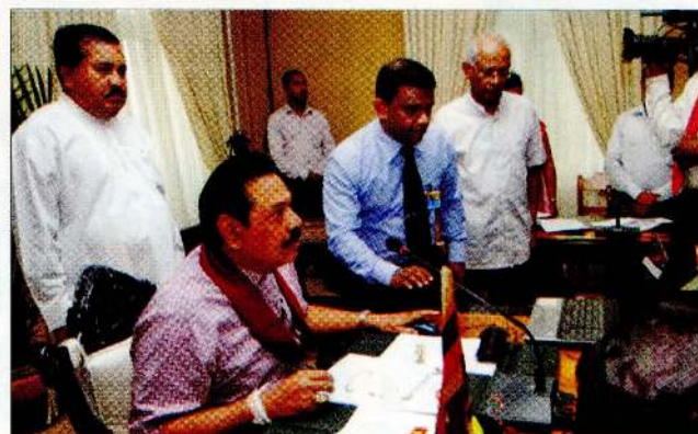
President opening the website

The website for Prof Ediriweera Sarachchandra was opened by President Mahinda Rajapaksa at Temple Trees.