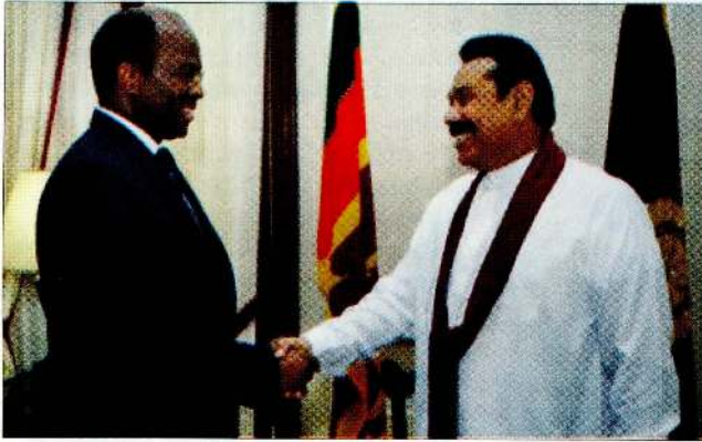
Yipene Djibrill Bassole, Senior Minister of Foreign Affairs and Regional Cooperation of Burkina Faso greeting the President

Yipene Djibrill Bassole, Senior Minister of Foreign Affairs and Regional Cooperation of Burkina Faso called on President Mahinda Rajapaksa at the Presidential Secretariat. Conveying a message from President of Burkina Faso, Blaise Compaore, Bassole commended President Rajapaksa's "effort to develop the country and to increase stability and reconciliation." Bassole said one of the purposes of the visit to Sri Lanka is to strengthen south-south cooperation. Burkina Faso being a member of the UN Human Rights Council (UNHRC), he said, "We have to show solidarity."