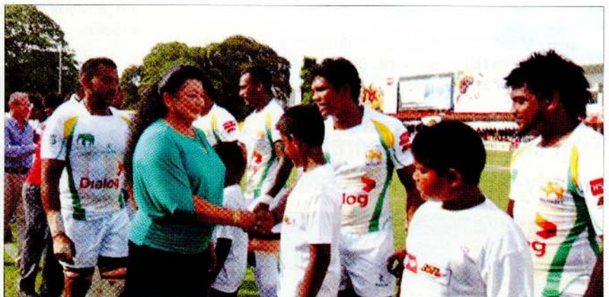
First Lady being introduced to the Sri Lankan Rugby team

President Mahinda Rajapaksa and Johnston Fernando, Minister of Cooperatives and Internal Trade enjoyed Sri Lanka's victory