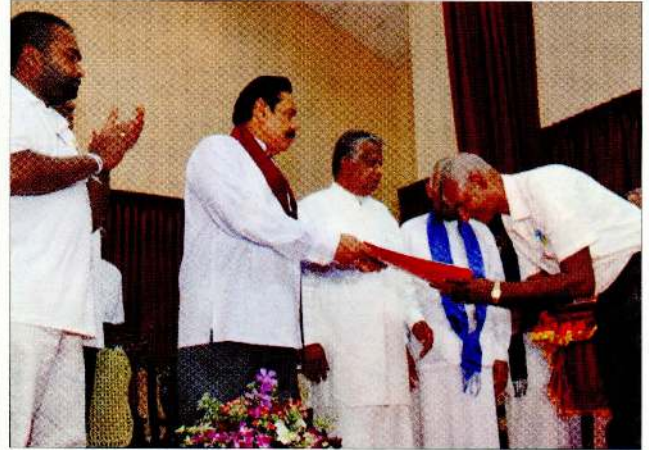
President awarding the Ranbima deeds

Keeping in line with the Deyata Kirula Exhibition, President Mahinda Rajapaksa distributed Ranbima ownership deeds to the north eastern people.