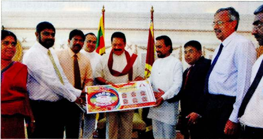
The first Jana Sevana Lottery being presented to President