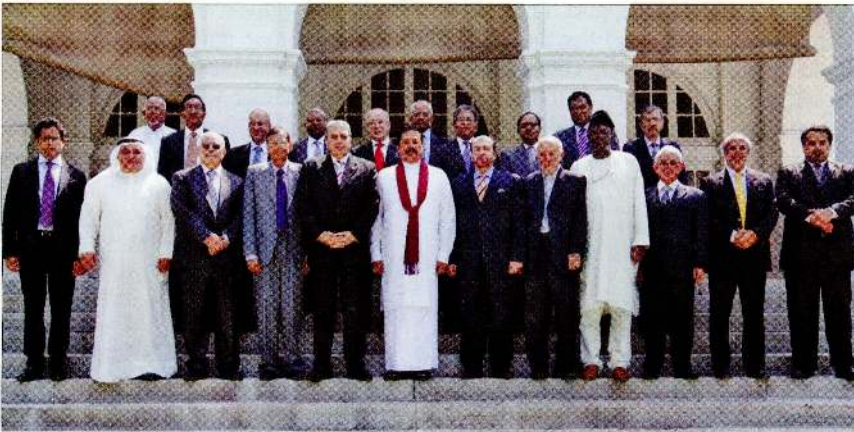
President and Diplomatic Heads of Islamic countries

Fifteen diplomatic heads of Islamic countries, resident in Sri Lanka, met with President Mahinda Rajapaksa at Temple Trees