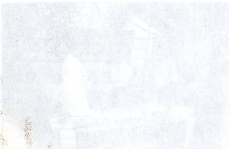
Photograph taken during the... of the... the...