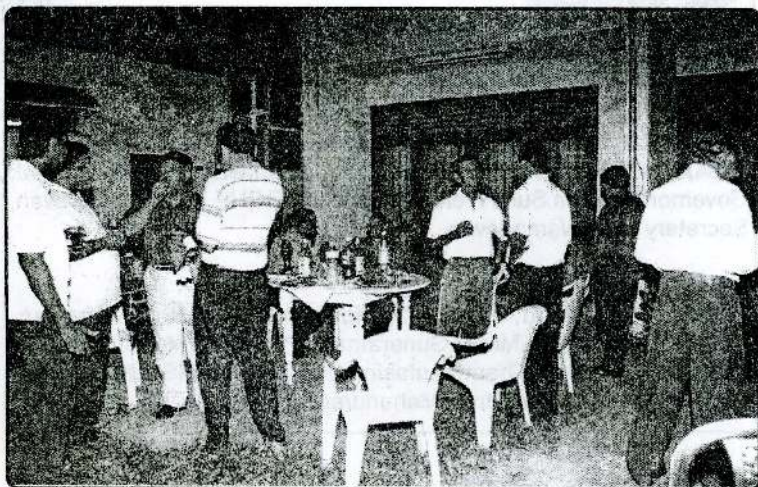
Members of Rotary Club, Colombo and Rotary Club of Jaffna at a party.