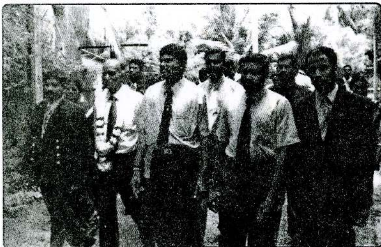
Rotarians being received by Nallur Rotaractors on 26-10-2004 at the ceremony for the installation of the New President.