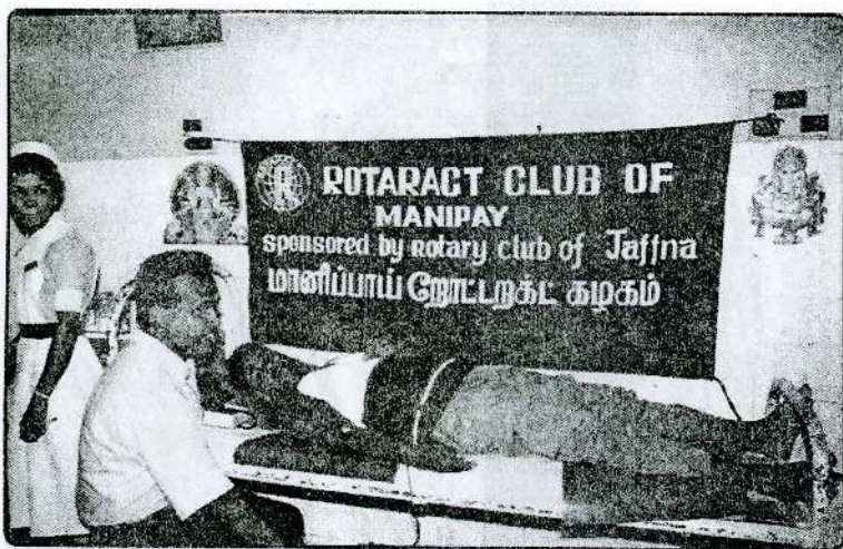
Rotaract Club of Manipay in Action. The president of Rotaract club of Manipay donating blood at Jaffna General Hospital.