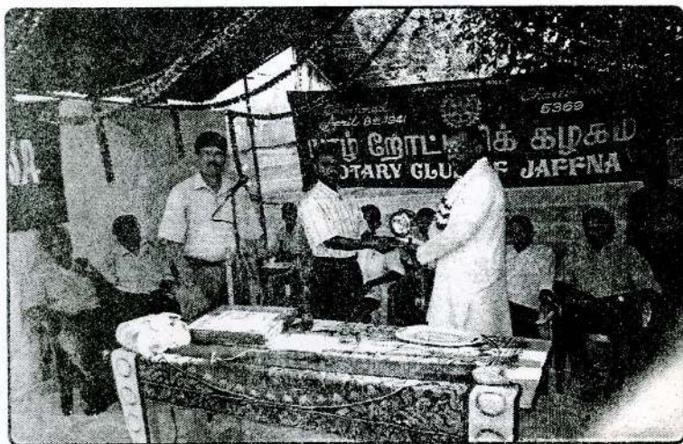
Literacy Day 2004 being celebrated at Sabapahipillai Refugee Camp.