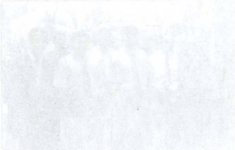
Photograph taken during the... of the... the...