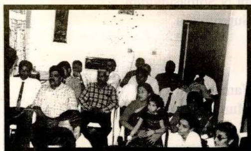
Some of the anns, annets and Rotarians