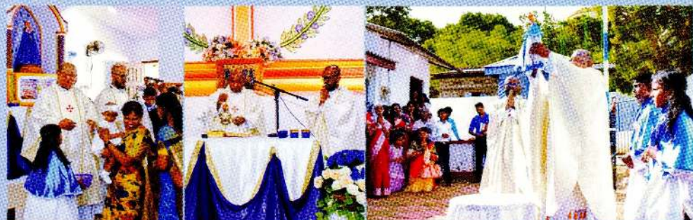
Feast of Our Lady of Madhu, Varodhya Nagar, Alles Garden Parish – 07.07.2024