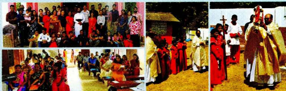
Feast of the Sacred Heart of Jesus, Kantalai, Kantalawa Parish – 07.07.2024