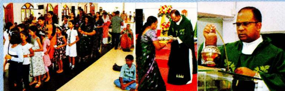
Indigenous Clergy & Religious Day celebrations, Alles Garden parish – 28.07.2024