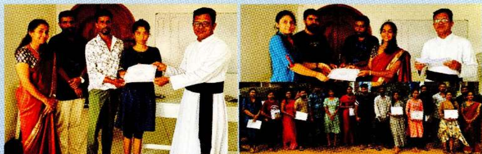
Marriage Preparatory Session (July & August) – 06.07.2024