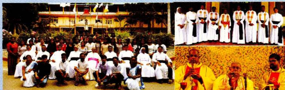
Inauguration of the one-month Residential Catechists' Training at Madhu Shrine organized by the North - East Bishops' Council – 06.07.2024