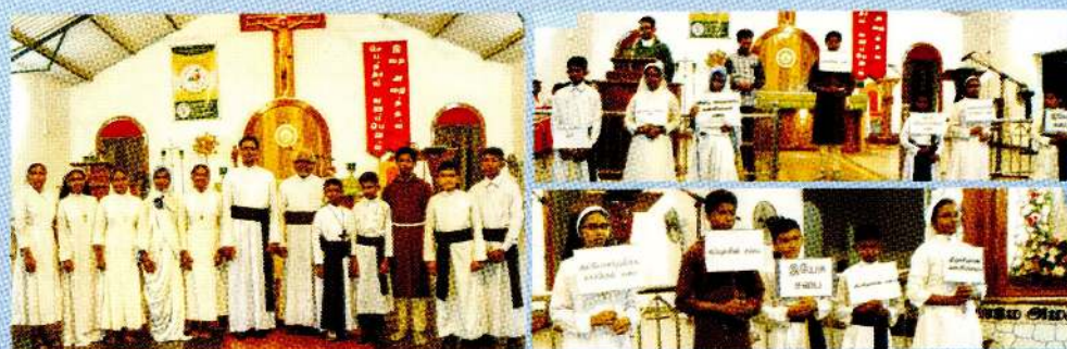
Indigenous Clergy & Religious Day celebrations, Palaiyoothu parish – 28.07.2024