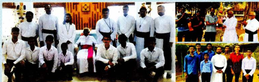
St. Joseph Vaz Minor Seminary Day Celebrations – 06.07.2024