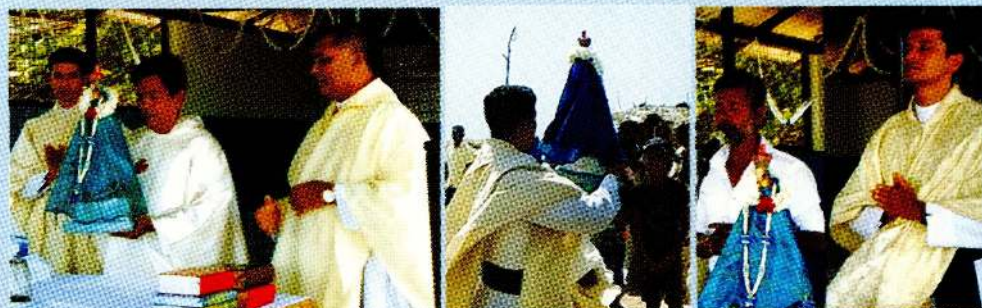
Feast of Our Lady of Good Voyage, Salappaiaaru, Kutchchveli parish – 21.07.2028