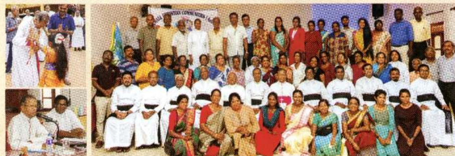
National Meeting of the SCCs (Anpiyam), Deepam Centre – 7th & 8th May 2024