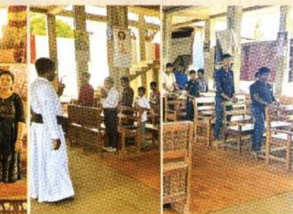
Altar Servers' training session at Infant Jesus Church, Orr's Hill – 24.05.2024