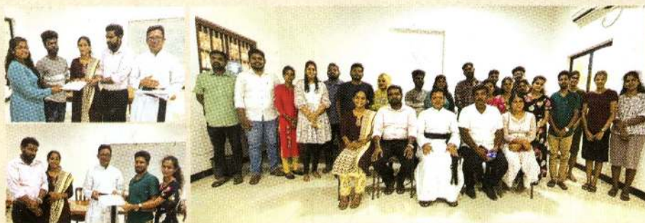
Marriage Preparatory Seminar – 02.05.2025