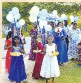
Month of May Celebration at Kanniya Parish – 31.05.2024