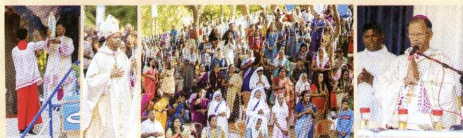
Festive Mass - Our Lady of Lourdes, Diocesan Shrine – 03.05.2024