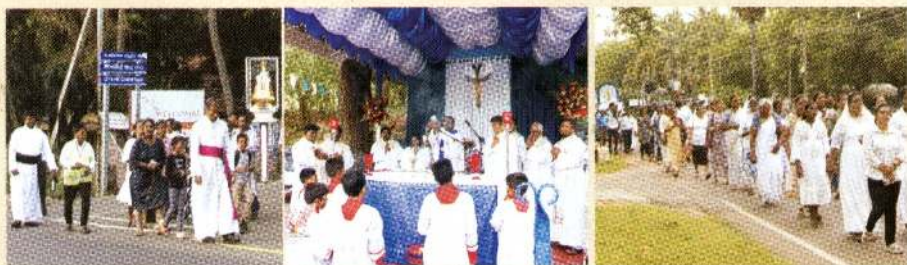
Diocesan Rosary Rally – Our Lady of Lourdes Shrine, Palaiyoothu – 02.05.2024