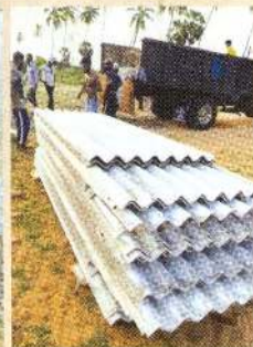
Construction of St. Anthony's Church at Kallarawa, Kuchchaveli Parish