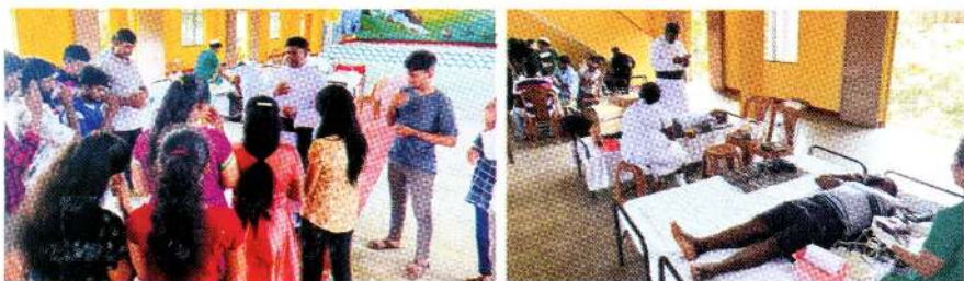
Blood Donation Camp organized by the Catholic Youth Federation of the Diocese on July 2, 2023