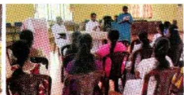
Nilaveli Regional Pastoral Council's Meeting and a talk on the theme of 'the Role of the Laity in the Church' held at Nilaveli on June 10, 2023.