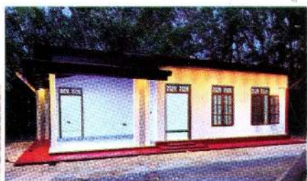
Opening of a long-felt need of the Kantalawa parish: a decent Parish House for the Parish Priest to reside. His Lordship the Bishop blessed and opened the mission house on July 18, 2023.