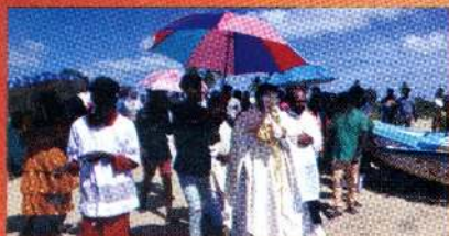
Feast of St. Anthony of Paduva, Kallarawa, Kutchaveli Parish 13.06.2023