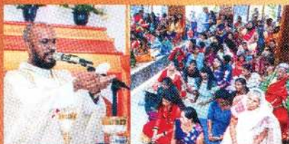
Feast of Our Lady of Madhu, Varodaya Nagar, Alles Garden Parish 16.07.2023

PRIVATE CIRCULATION ONLY EDITED & PRINTED BY: