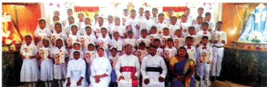
Sacraments of First Holy Communion and Confirmation were administered by His Lordship the Bishop to the Children of St. Joseph's Church, Nilaveli on July 16, 2023.