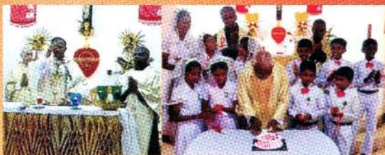
Feast of St. Anthony of Paduva, Muttur 25.06.2023