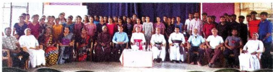
Inaugural meeting to encourage and prepare students to take part in the Law College Entrance Examination held at Mutur Region held on July 16, 2023. 53 participants from various villages of Mutur participated in this remarkable event.