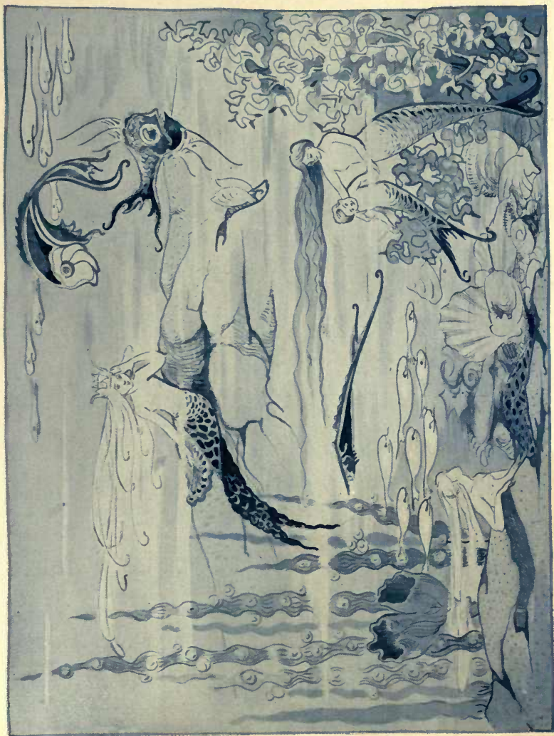
BEVIS AND THE MERMAIDS.