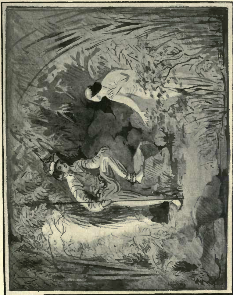
IN THE GROTTO.