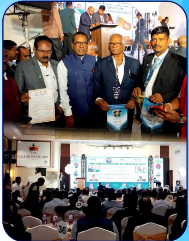
DISTRICT GOVERNOR OFFICIAL VISIT