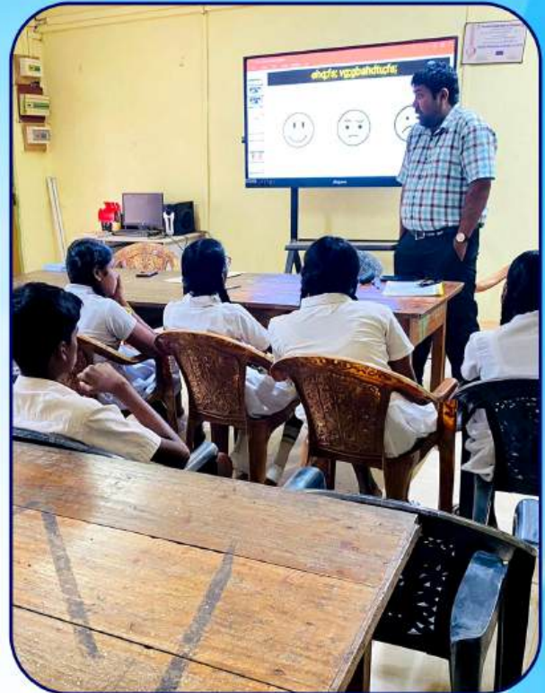
SUCCESSFUL PROJECT BASED ON DRUG AWARENESS AT EAR LALAI MAHAVIDJALAJAM ALONG WITH DIVISIONAL SECRE TARY TELLIPPALAI AND VALI NORTH RESORCE CENTRE (VNRC)