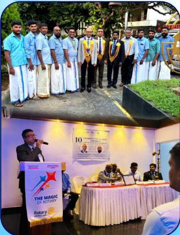
10TH INSTALLATION CEREMONY