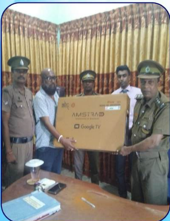
WE PROVIDED TV FOR JAFFNA PRISION FOR THE WELLBIENG OF THE PRISONERS