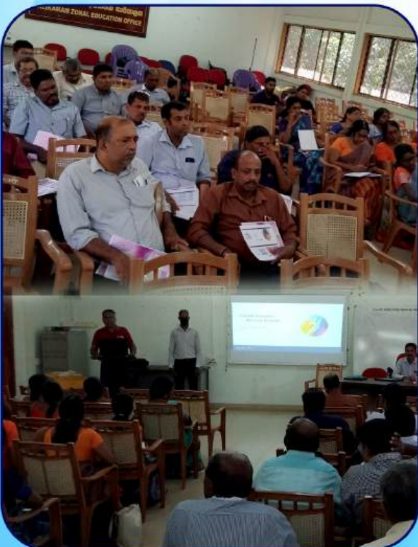
OUR CLUB ORGANISED CAREER GUIDANCE EVENT IN THE VALIKAAMAM ZONAL DEPARTMENT OF EDUCATION.