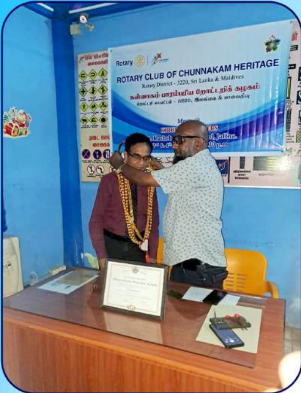
10TH INSTALLATION CEREMONY