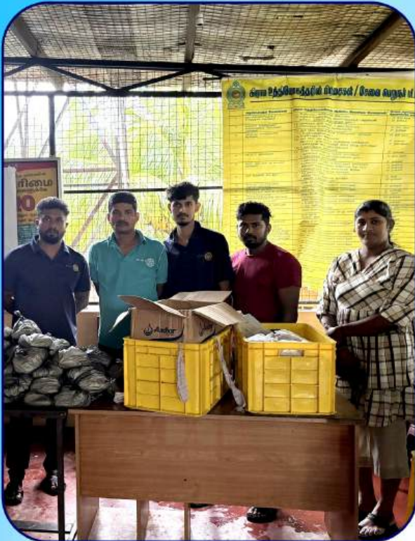
PROVIDED FOOD FOR THELLIPALAI PEOPLE WHOEVER AFFECTED BY FLOOD.