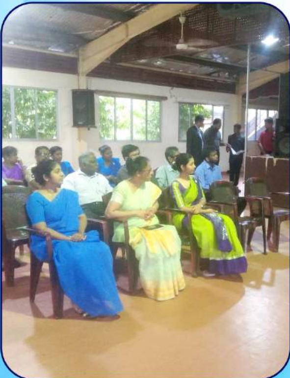
CELEBRATED THE INSTALLATION CEREMONY OF THE INTERACT CLUB OF ANGEL INTERNATIONAL SCHOOL