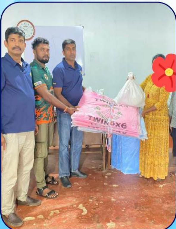
PROVIDED MOSQUITO NETS AND DRY FOODS TO THIRUNAVATKULAM VAVUNIYA DISLOCATED PEOPLE