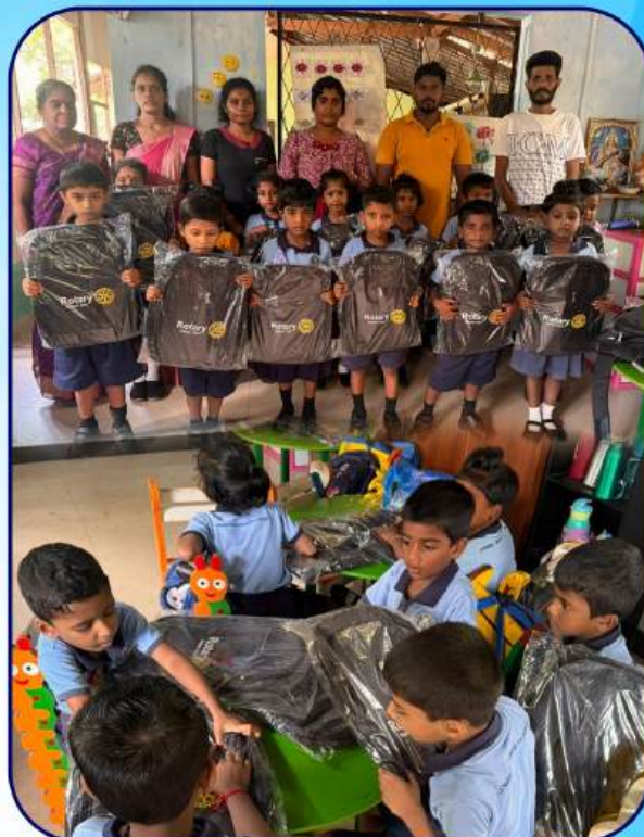
20 SCHOOL BAGS TO UNDERPRIVILEGED CHILDREN STUDY-ING AT MUTHTHAMIL PRE SCHOOL, KALVIYANKAADU.