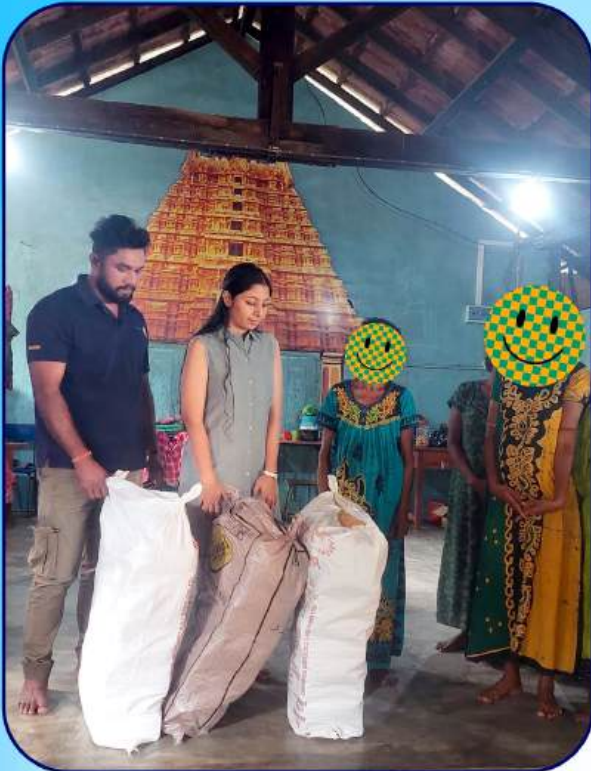
DISTRIBUTED BREAD TO FLOOD-AFFECTED INDIVIDUALS IN THE NALLUR AREA