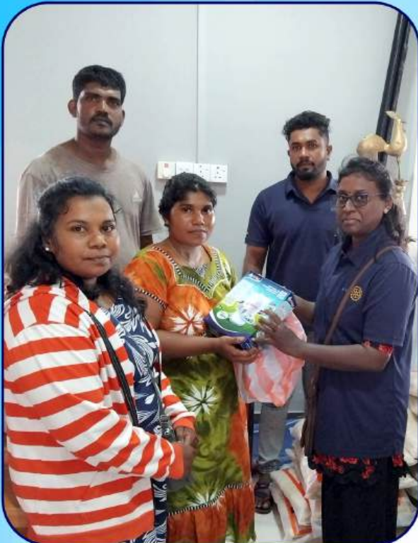
DISTRIBUTED DRY FOOD PACKAGES TO THE FLOOD-AFFECTED RESIDENTS OF KALLUNDAL.