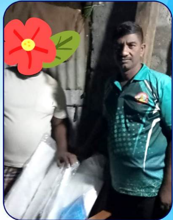
PROVIDED PLYMATS TO A FAMILY WHO TRULY NEEDS THE NECESSARY SUPPORT