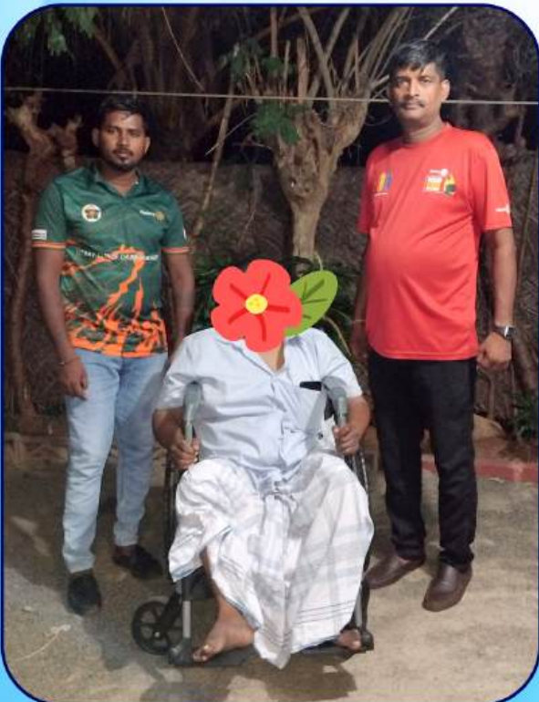
A WHEELCHAIR PROVIDED TO A POLIO AFFECTED PERSON.