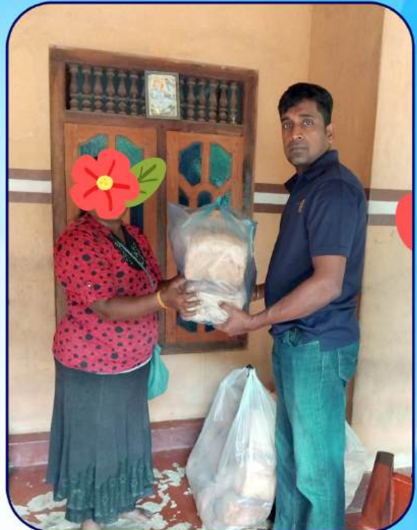
PROVIDED BREADS AT MANTHUVIL AREA PEOPLE.