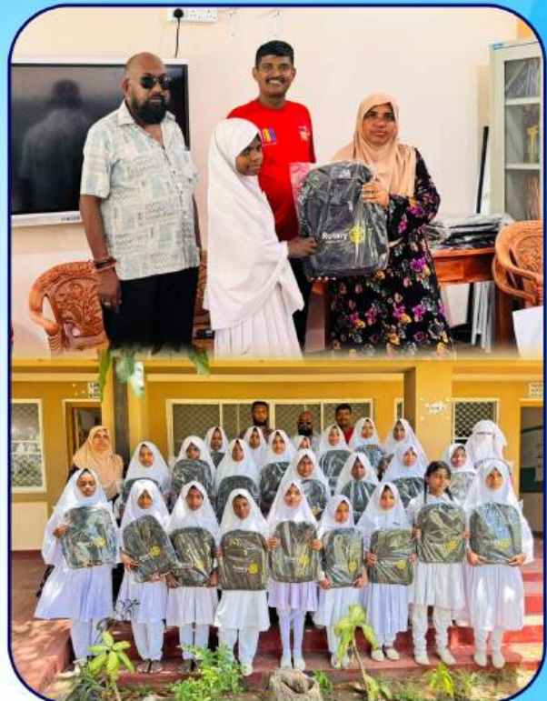
30 SCHOOL BAGS TO UNDERPRIVILEGED CHILDREN STUDYING AT OSMANIA COLLEGE JAFFNA