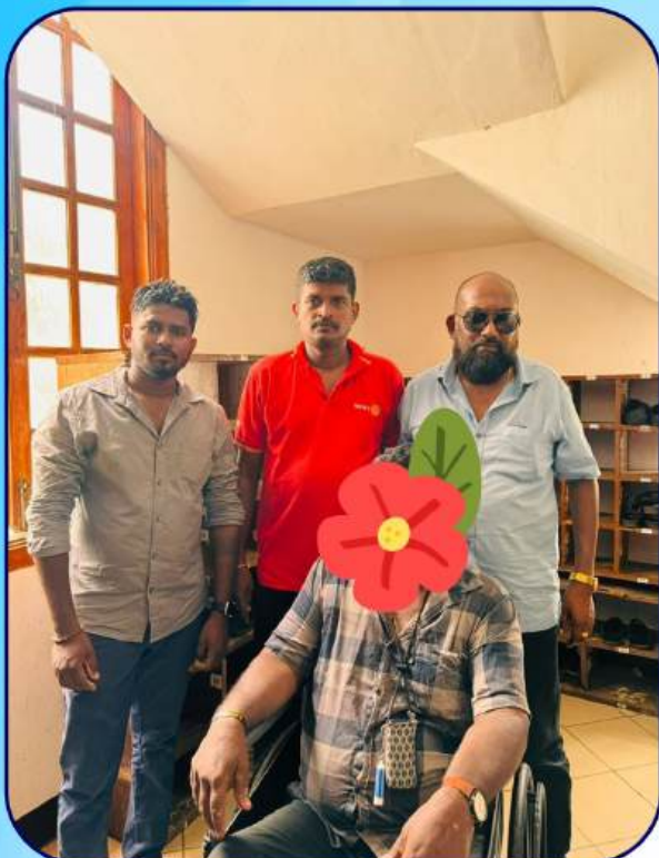
A WHEELCHAIR PROVIDED TO A POLIO AFFECTED PERSON.