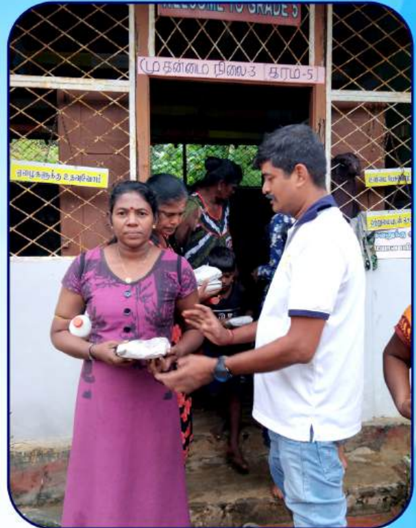
LUNCH GIVEN TO THE ILAVALAL MANIPAL AND SANDILIPAL PEOPLE.