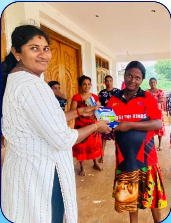
PROVIDED FOOD FOR THELLIPALAI PEOPLE WHOEVER AFFECTED BY FLOOD.