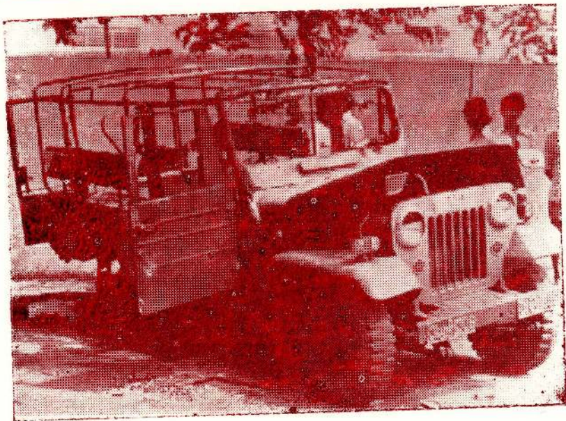
My Jeep completely burnt