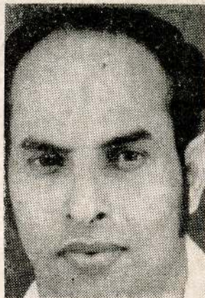
V. YOGESWARAN MEMBER OF PARLIAMENT For JAFFNA