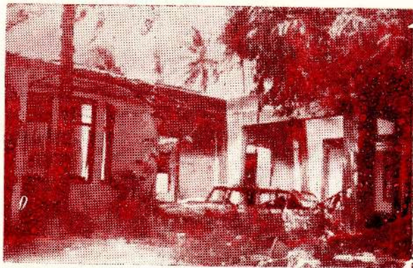
Another view of my House