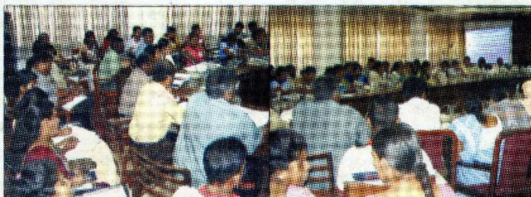
District Review Board Meeting at Hector Kobbekaduwa Agrarian Centre in Colombo 07.