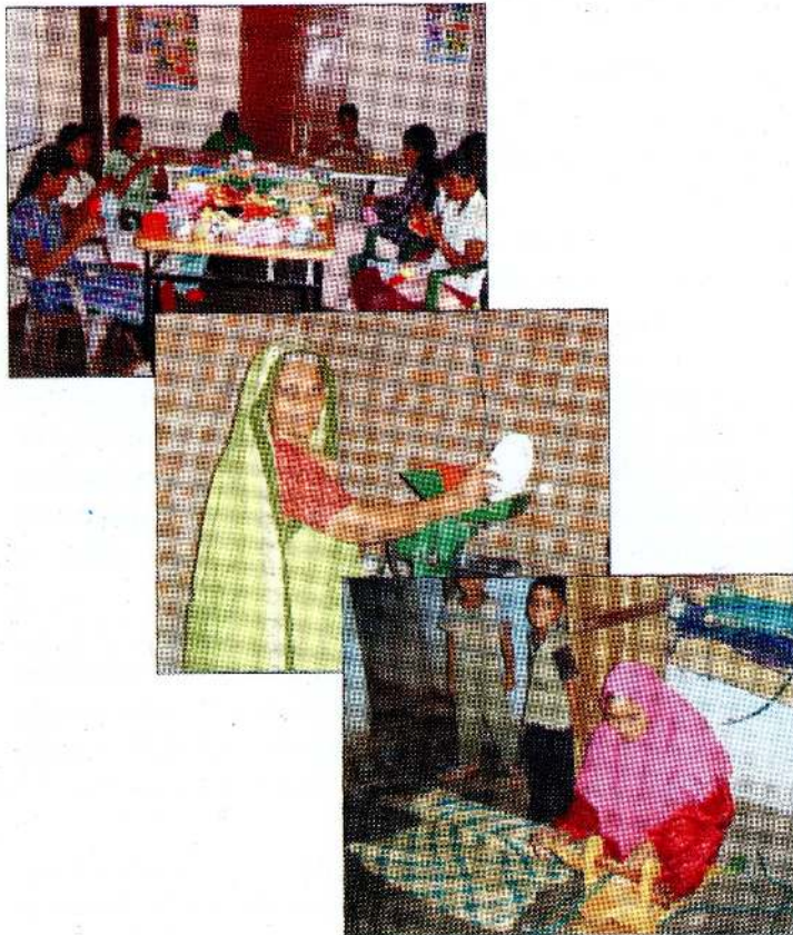
Livelihood Programmes in Batticaloa for Conflict Affected Families (i.e. woollen garments, matting, rice flour processing)