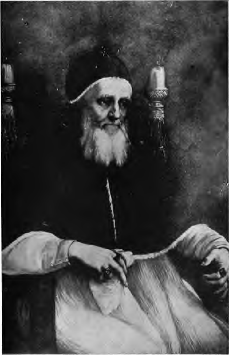
POPE JULIUS II., 1503-1513.

Portrait by Raphael, in the National Gallery, London.