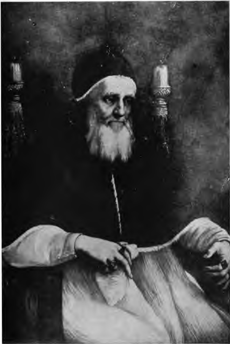
POPE JULIUS II., 1503-1513.

Portrait by Raphael, in the National Gallery, London.