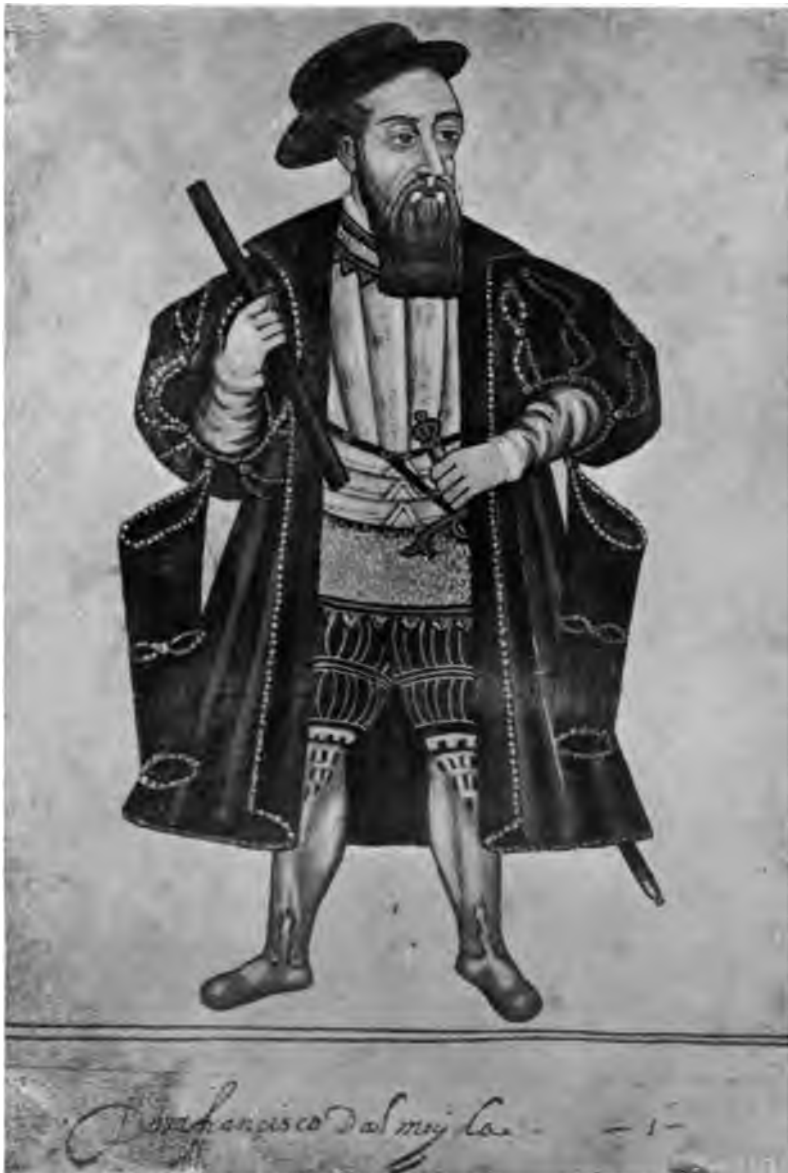
DOM FRANCISCO DE ALMEIDA.

Copied from the Hakluyt Society's "Commentaries of Afonso Dalboquerque" li. 48.