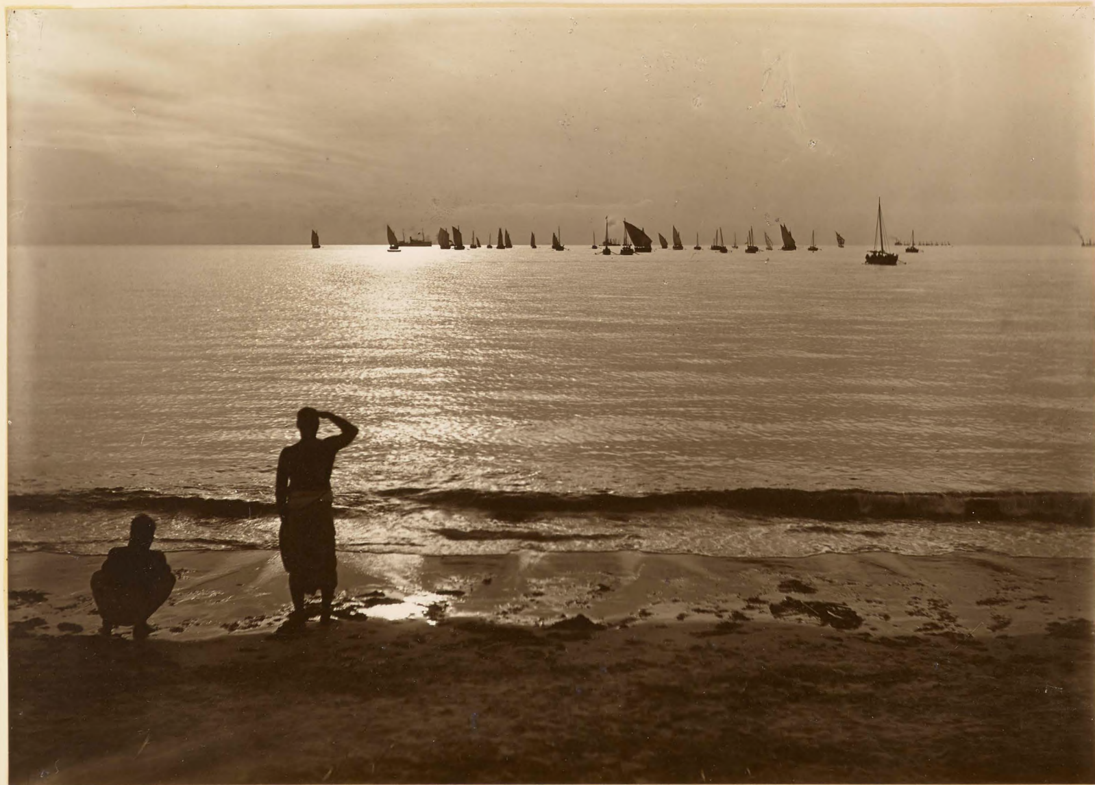
The Fleet Returning at Sunset.