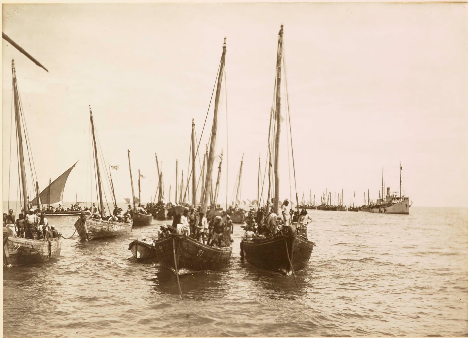
Taking the Fleet in Tow.