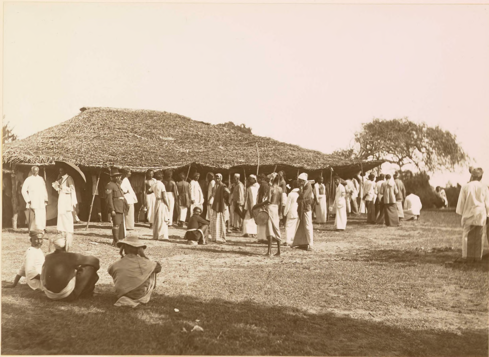
The Court House.