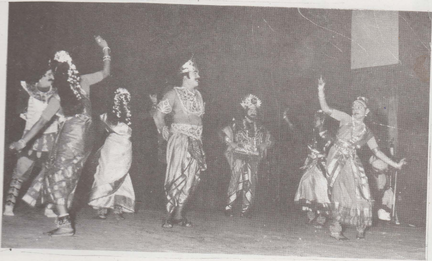
His father makes him the Viceroy of Ujjain. After the death of his father, Ashoka gets his brother killed and ascends the throne.