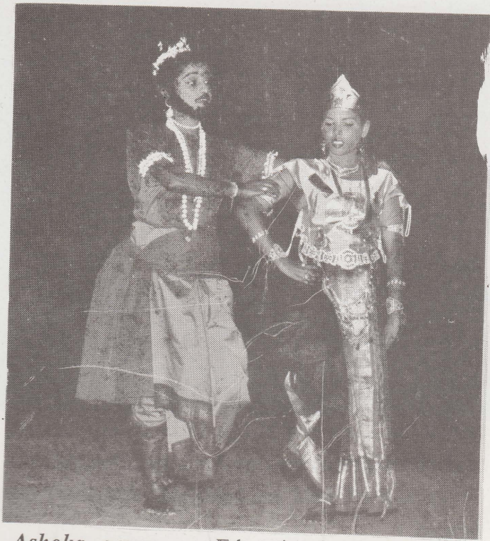
Ashoka grows up. Education is imparted especially in the martial arts.