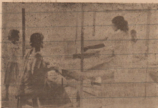
Economic Activities in Welfare Centres

There was mass exodus of people in large numbers espe- cially from East, Coastal Areas of the Jaffna Peninsula and from Vanni and Mannar Districts. Most of the dis- placed persons are languish- ing camps.