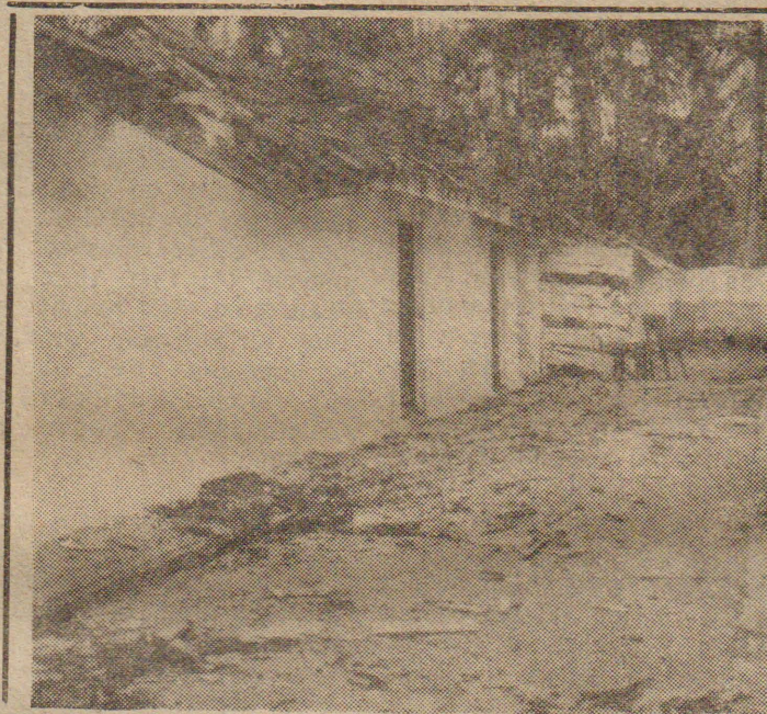
Gohagoda Pillayar Temple, Katugastota which was allegedly attacked on the 19th August, 1977 at 10-30 a. m. Picture shows the debris in the temple's inner courtyard