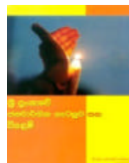
Sama Kriyawaalia Pilibanda Vimasumak (A collection of views on the Peace Process)

http://www.cpalanka.org/research_papers/PCI_17_topline_results.pdf