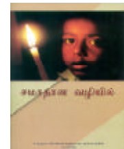
Samadana Valiyil (On the Road to Peace)

CPA's Polling Unit, Social Indicator, has released the results of Wave 17 of its Peace And Confidence Index .