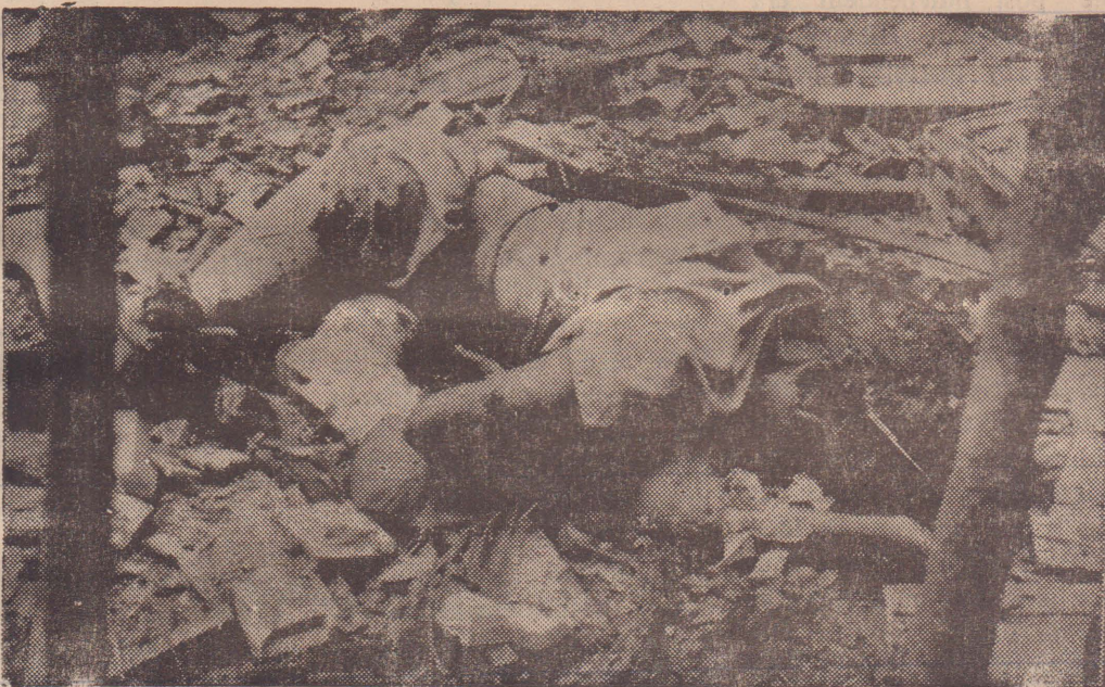
The battered body in the debris after a bombing spree by Puccaro planes at Thavady at 11.00 a.m. on 5.1.94.

The wanton killing of the public was another incident which proved to the Tamils that their security rested with them and NOT in the hands of the armed forces or police of the Sinhala Government.