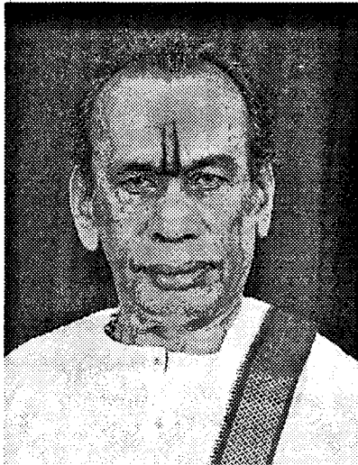
Plunging the world of Carnatic Music and Bharath Natyam enthusiasts in great