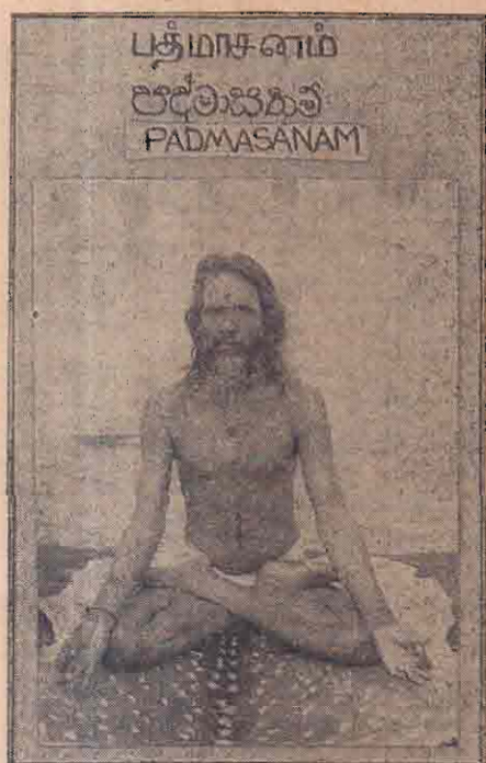
Pathmasana Posture -- 5-20 Minutes