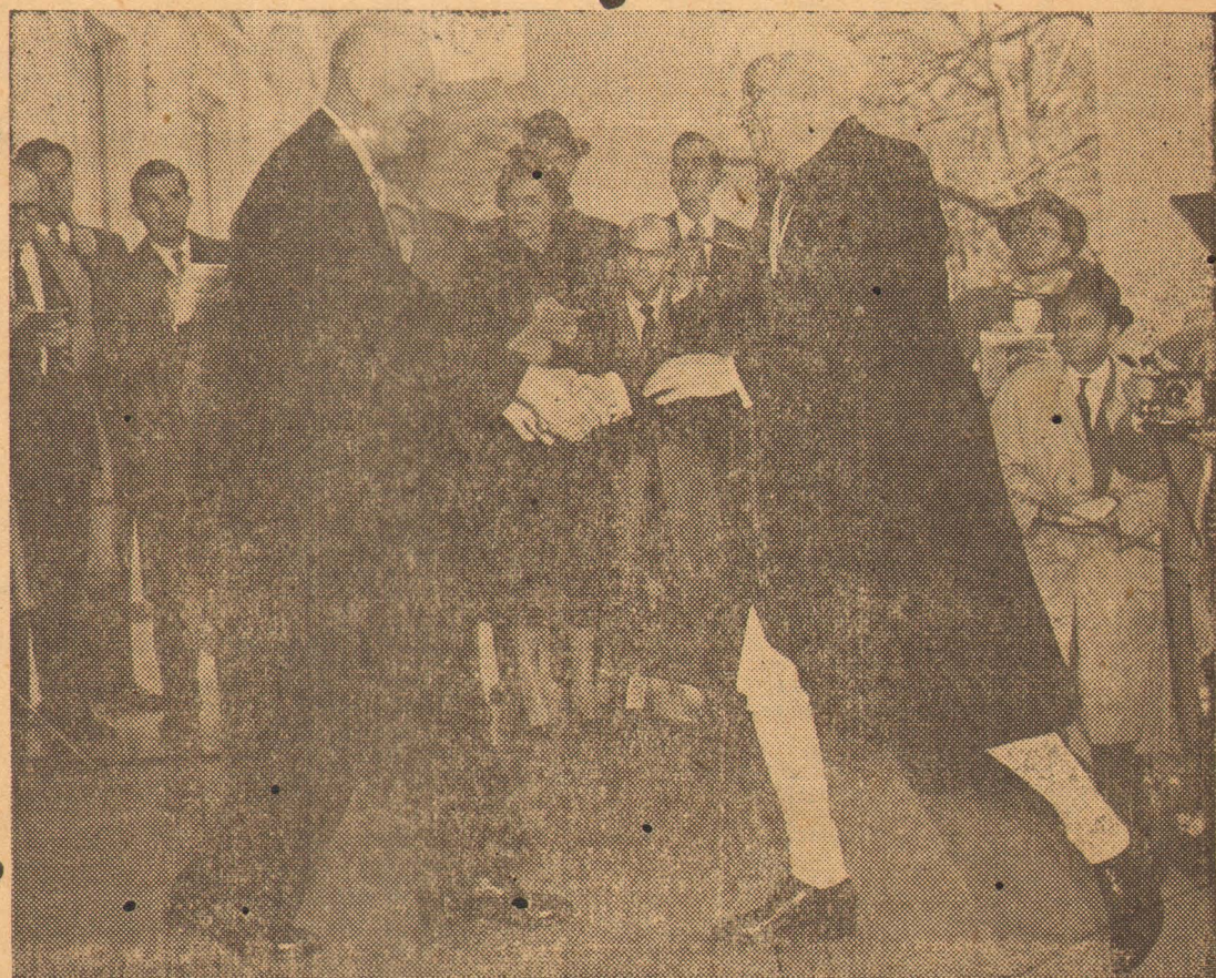
President Eisenhower welcomes Prime Minister Nehru to the White House following the Indian leaders arrival in the United States for a six-day state visit. The two also conferred at the President's farm near Gettysburg Pennsylvania, after which Mr. Nehru visited the United Nations in New York City.