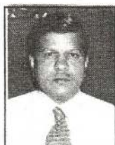
Asst. Director of Education