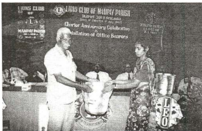
Project at the 16 th Charter anniversary celebration and 17 th Installation of office bearers -20 th July 2003