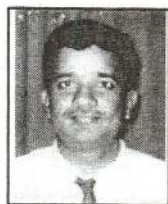
Senior University Lecturer