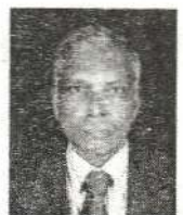
Retired Post Master