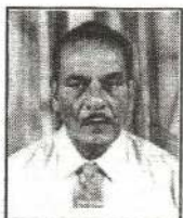
Retired Regional Engineer