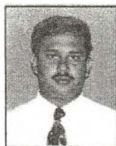
Executive Bank officer