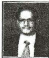
Attorney at Law