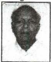
Retired Assistant Supdt. of Surveys