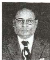
Road Maintenance Contractor