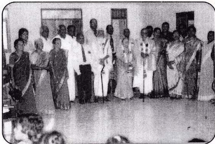
Quests elders, and members of the club on the elder's day.