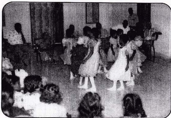
A dance programme by the children of Aranery School at Thurgapuram held on the children's day.