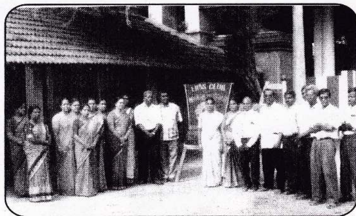
Members of our club and staff of Mallakam Maha Vidyalayam on the U. N. Day.