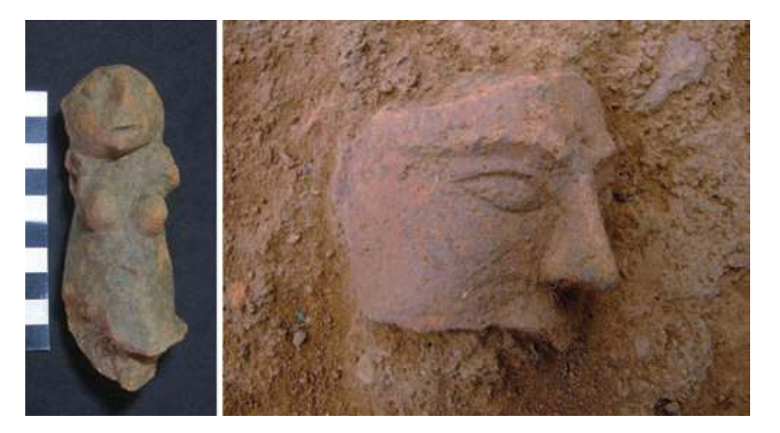
Fig. 1.6 Terracotta figurine fragments from the site of Nikawewa (D339), including a depiction of a human face (right) and an anthropomorphic phallus (left), authors' photograph.

narrative appears silent. From a hinterland survey around Anurādhapura, a total of 489 terracotta artefacts from eight sites, the majority excavated at Nikawewa (D339), were recorded. 166 Dating to between 900 and 1300 ce, 167 these artefacts include human and animal figurines as well as anthropomorphic phalli (Figure 1.6). They were deliberately broken and may reflect a practice not far from that described in studies of the Gammaduva ceremony. 168 Deposited in caches across the Dry Zone and known from more than twenty sites, they display a distinct uniformity of design and were clearly restricted to non-monastic and non-urban sites. Traditionally categorized as 'folk' art, they have nevertheless been found associated with a monumental structure at Nikawewa. We have thus reinterpreted them as representing a powerful shared and formalized corpus of ritual practice parallel to Buddhism. 169 This example highlights the ability of archaeology to recognize groups operating outside official state or elite circles. It further suggests that early medieval Anurādhapura was capable of incorporating multiple religious and ritual networks. 170