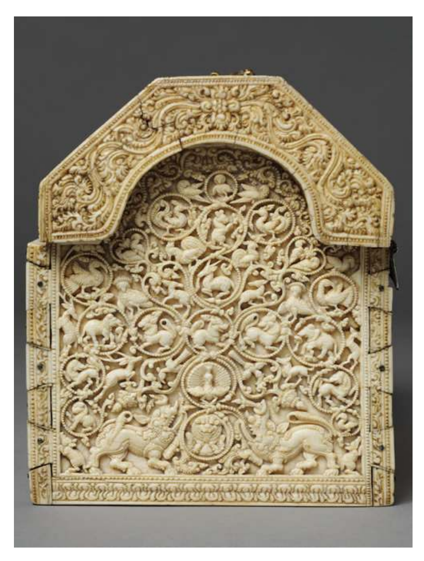
Fig. 6.14 Kalpavrksha/Kalpalata (auspicious vines) on the 'Robinson casket', lateral panel (left), Sri Lanka, probably Kōṭṭe, mid-sixteenth century, Inventory no. IS.41–1980.

emerges out of the tails of the half-man, half-bird creatures (Figure 6.11) as well as from the mouths of two makara -headed lions on the left end (Figure 6.14). Based on the unusual combination of the makara and the lion, they suggest that 'here the artist may have sought to emphasize the role of kingship (represented by the lion) in creation, as represented by the makara and cord of life'. 56 Jaffer and