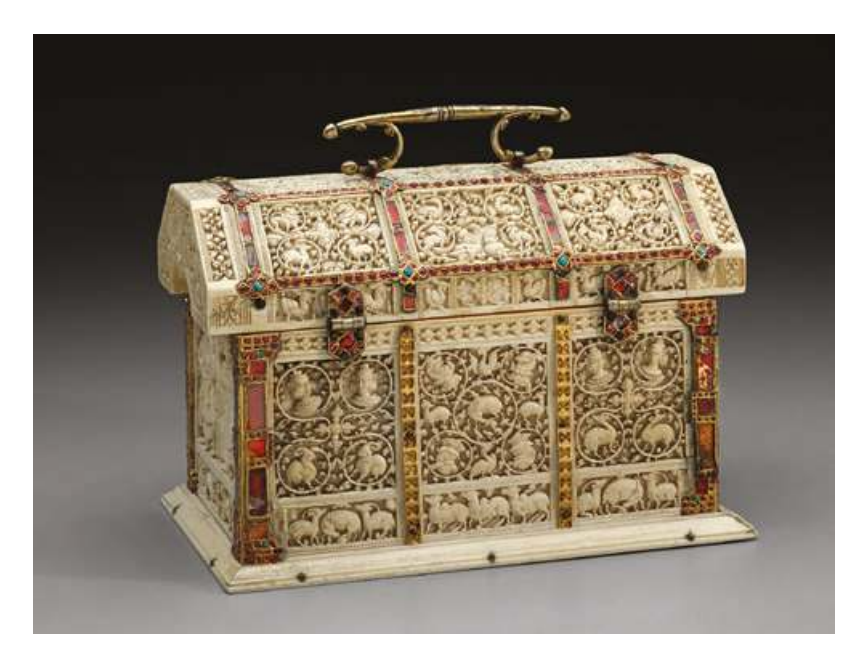
Fig. 6.16 Casket, back panel, Sri Lanka, mid- to late sixteenth century, Bequest of William A. Coolidge, Accession no. 1993.29.