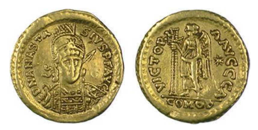
Fig. 2.2 Gold solidus of Theoderic I of Italy, struck in the name of Anastasius, probably in Italy, Barber Institute of Fine Arts, VV07 (Whitting No. G520), 4.28 grams, die axis 6 o'clock, Hahn MIB 9. ^{61}

but most Indian imitations mirror the weight of official solidi suggesting that this was important for their acceptability in the East.<sup>59</sup> Furthermore, Ratto, a European collector with no known connection to the Indian Ocean, in the 1930 sale catalogue of his own collection, recorded an example of such a lightweight solidus of Theodosius II, noting that it was 'de poids réduit... Très rare. Très beau.'<sup>60</sup> If this were an Indian Ocean imitation, it would be highly unlikely for a collector in Europe to have come across an identical specimen. It therefore seems likely that de Saram purchased this coin in Europe precisely because of its rarity and fine condition.