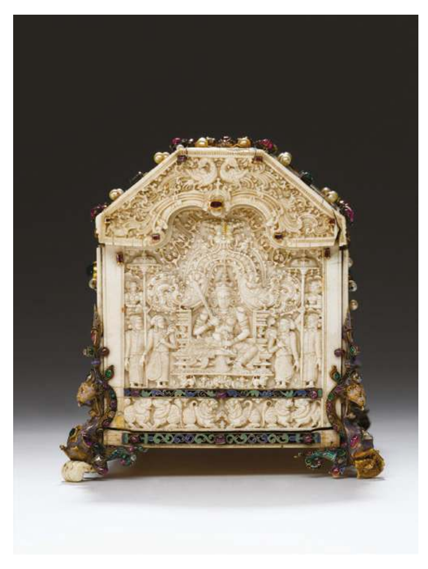
Fig. 6.7 Casket, lateral panel (left), Kōṭṭe, 1540s, Schatzkammer der Residenz, Munich, Inventory no. 1242.

on the basement mouldings of the audience halls of King Parākramabāhu I and King Niśśaṅkamalla, as well as at the Buddhist structures of Manik Vehera ( stupa ) and Hāṭadāgē (image house). From the fourteenth-century Gampola kingdom, we see lions carved in various postures on the stone basement mouldings of the entrance pavilion to Niyamgampāya Rājamahā Vihāra. At Gaḍalādeṇiya Rājamahā Vihāraya, a row of lions adorns the stone steps leading up to the temple