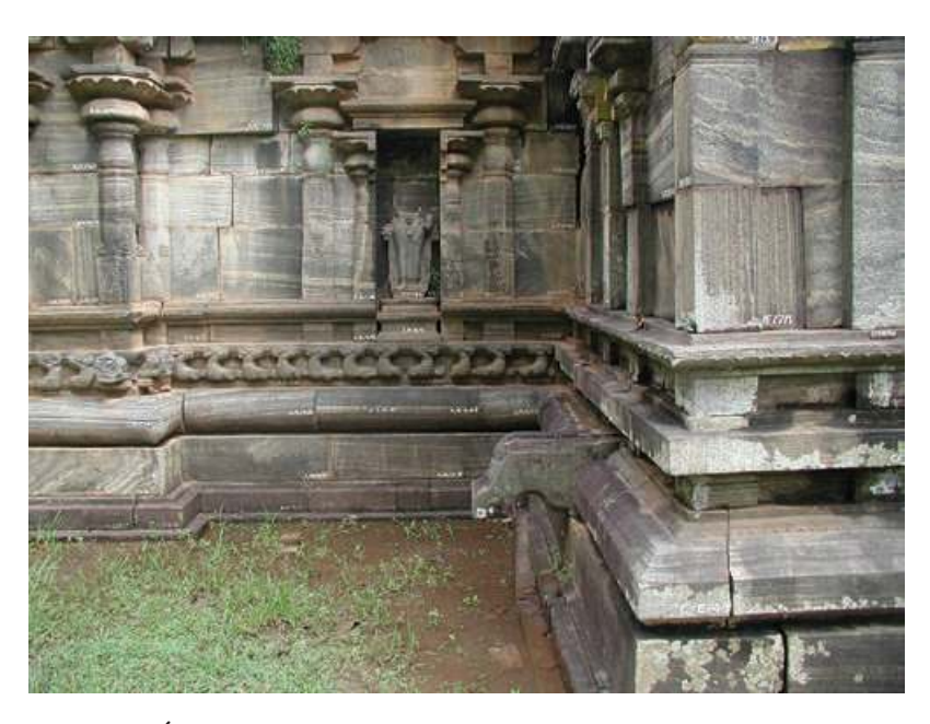
\label{eq:fig.6.10} \textbf{ \'Siva Dev\"ale No. 1, Polonnaruva, eleventh or twelfth century.}