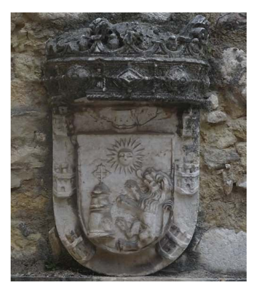
Fig. 7.1 Royal escutcheon of Prince Dom João of Kandy, Museu Arqueológico do Carmo, Lisbon, Inventory no. ESC221, author's photograph.

of his cousin Dom Filipe, which, it seems, were brought back from Coimbra. On a wall of the chapel, an escutcheon carved in stone showed a shield not only bordered by the seven castles of Portugal's coat of arms, but also with, at its centre, the Sinhalese lion rampant (Figure 7.1). Next to it stood a tower-like object crowned with the cross of Avis in reference to the dynasty named in the testament of Dharmapāla. Above the lion and the tower, the escutcheon showed a resplendent sun in reference to Dom João's descent from the solar dynasty, the suriyavamsa . Returning to a more assumedly Iberian register, the shield also supported an open crown, the proud symbol of all grandees. 82