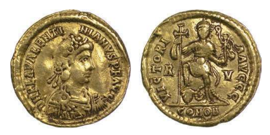
Fig. 2.4 Gold solidus of Valentinian III, struck in Ravenna, Barber Institute of Fine Arts, LR540 (Whitting No. G521), 4.36 grams, die axis 7 o'clock, RIC X, 202.<sup>66</sup>

early 1920s. They are both atypical for Byzantine coins found in India, but cannot on that basis be excluded from a Sri Lankan provenance, since finds from the island are too few to make such generalizations. The first (Figure 2.4) is a solidus of Valentinian III (r. 425–55) from Rayenna.