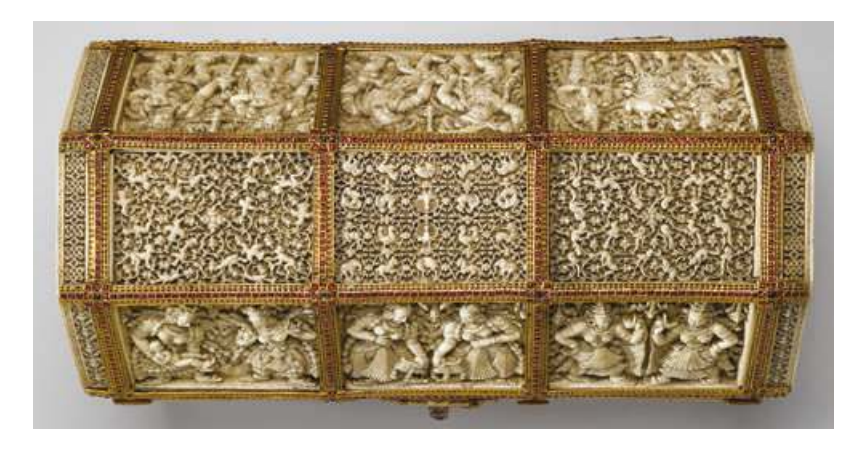
Fig. 6.17 'Coronation casket', lid, Kōṭṭe, c.1541, Schatzkammer der Residenz, Munich, Inventory no. 1241.

absent: the panels are completely ornamented with vines full of birds and animals, the latter encompassed by six circles of vines; and in-between the vines and at their edges are birds. The composition is similar to that of the vines full of animals and birds that are found on the lids of most of these caskets: rather than from an