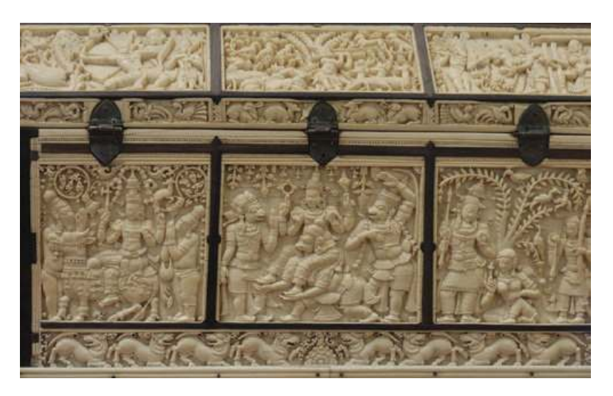
Fig. 6.6 'Peradeniya casket', back panel, Sri Lanka, mid-sixteenth century, The Senarat Paranavitana Teaching and Research Museum, Department of Archaeology, University of Peradeniya.

Like the lotus petals, rows of lions appear on the basement mouldings of certain medieval monuments. At Polonnaruva (1017–1215 ce), this motif is found