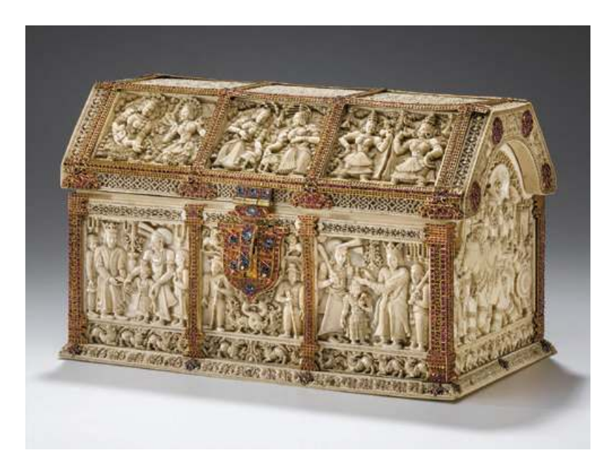
Fig. 6.3 'Coronation casket', Kōṭṭe, c.1541, Schatzkammer der Residenz, Munich, Inventory no. 1241.

the bottom of the so-called coronation casket at the Residenzmuseum in Munich (Figure 6.3). Caskets that do not have the row of lotus petals instead have a less elaborate arrangement, again resembling the basement mouldings of some South Asian temples: the ivory casket at the Boston Museum of Fine Arts thus sits on a plinth, which in turn supports the S-shaped cyma recta topped by a small fillet (Figure 6.4); a similar plinth, further ornamented with gold and rubies, can be seen in a casket kept in an undisclosed private collection.<sup>38</sup> Such features ornamenting basements, especially lotus petals, are often found in Sri Lankan temple architecture from the Anurādhapura period (c. 250 BCE–982 CE) onwards.<sup>39</sup>