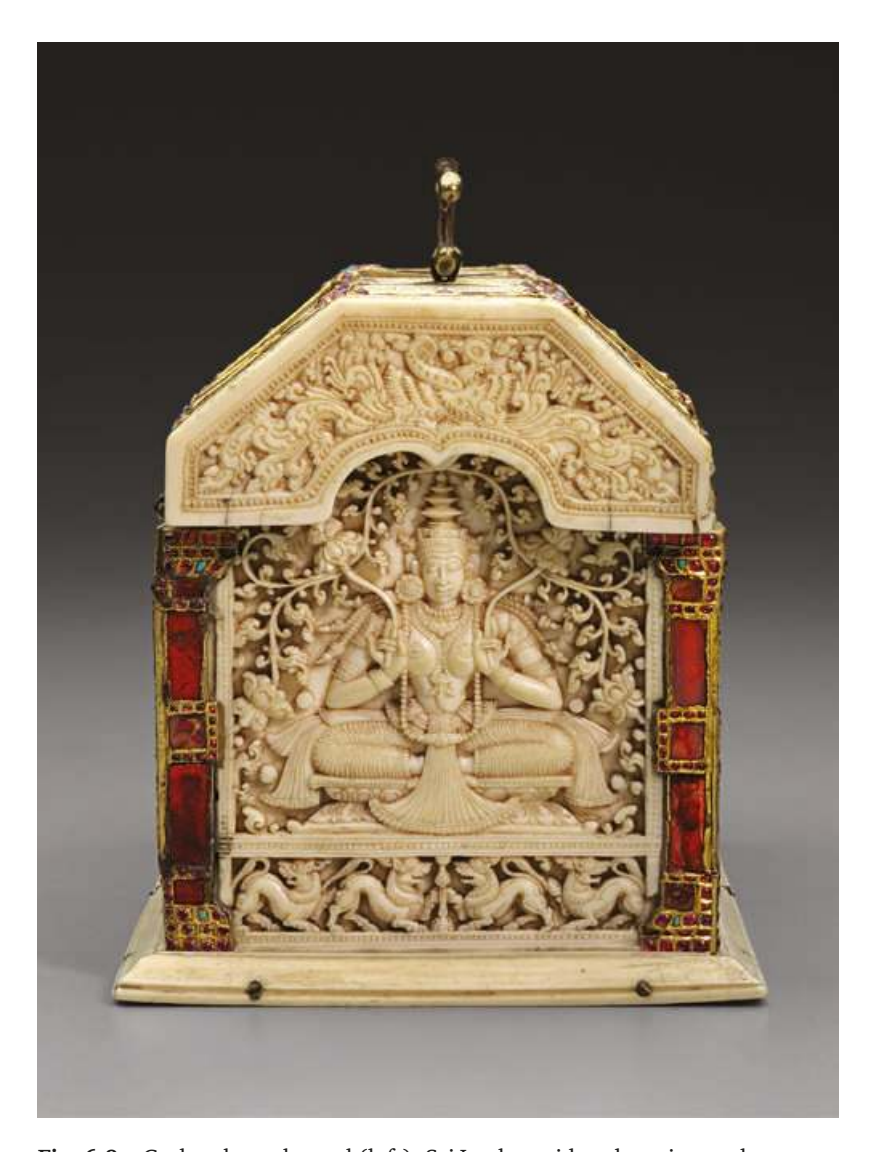
Fig. 6.8 Casket, lateral panel (left), Sri Lanka, mid- to late sixteenth century, Photograph © 2017 Museum of Fine Arts, Boston, Bequest of William A. Coolidge, Accession no. 1993.29.

(Figure 6.9). This motif and its location echo the vyāla, or mythical-lion motif, found especially on the basement mouldings of Hindu temples in South India, as well as in those built in Sri Lanka. The basement mouldings of Śiva Devale No. 1 in Polonnaruva, an eleventh- or twelfth-century stone Hindu temple in Sri Lanka (Figure 6.10) built by a South Indian workshop, provide an excellent example of the historical visual complexity of the lion motif and its placement at the bottom