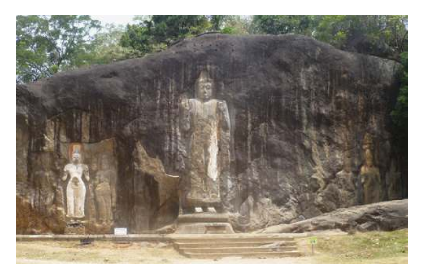
Fig. 1.5 Rock carved images at Buduruwagala, Monaragala District, authors' photograph.

prevalence of donations by monarchs drops to only 6.4 per cent. <sup>144</sup> While the high frequency of donations by monarchs around Anurādhapura could be anticipated, the overall picture is in stark contrast to the Mahāvaṃsa 's narrative, whereby rather than an expected elite-driven process of conversion, under the patronage of Devānaṃpiyatissa, leading to the majority of donations being royal in origin, a broader swathe of segments of society contributed to the establishment and growth of Buddhism.