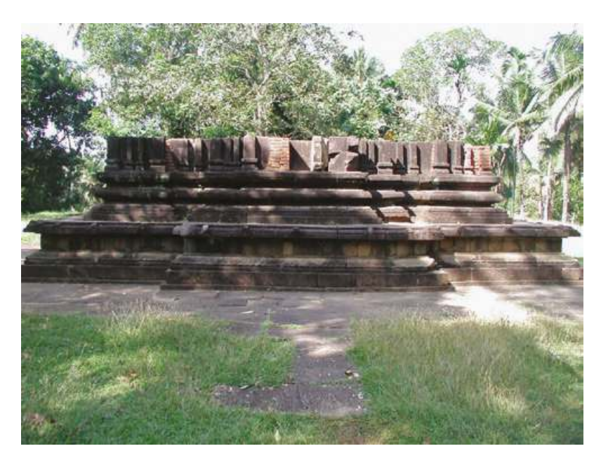
Fig. 6.5 Basement moulding, Bärändi Kövil, Sītāvaka, mid-sixteenth century.