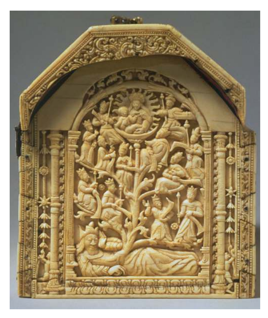
Fig. 6.12 Tree of Jesse on the 'Robinson casket', lateral panel (right), Sri Lanka, probably Kōṭṭe, mid-sixteenth century, © Victoria and Albert Museum, London, Inventory no. IS.41–1980.

printed by Thielman Kerver as early as 1499 (Figure 6.13), and reprinted repeatedly at least until 1546.<sup>53</sup> Apart from these depictions, Jaffer and Schwabe point to the reproduction of a print by Albrecht Dürer from 1514 on the front of the casket, which appears twice, in the right and left niches (Figure 6.2). They also point to two other scenes on the uppermost portion of the lid of this casket that were inspired by European prints.<sup>54</sup>