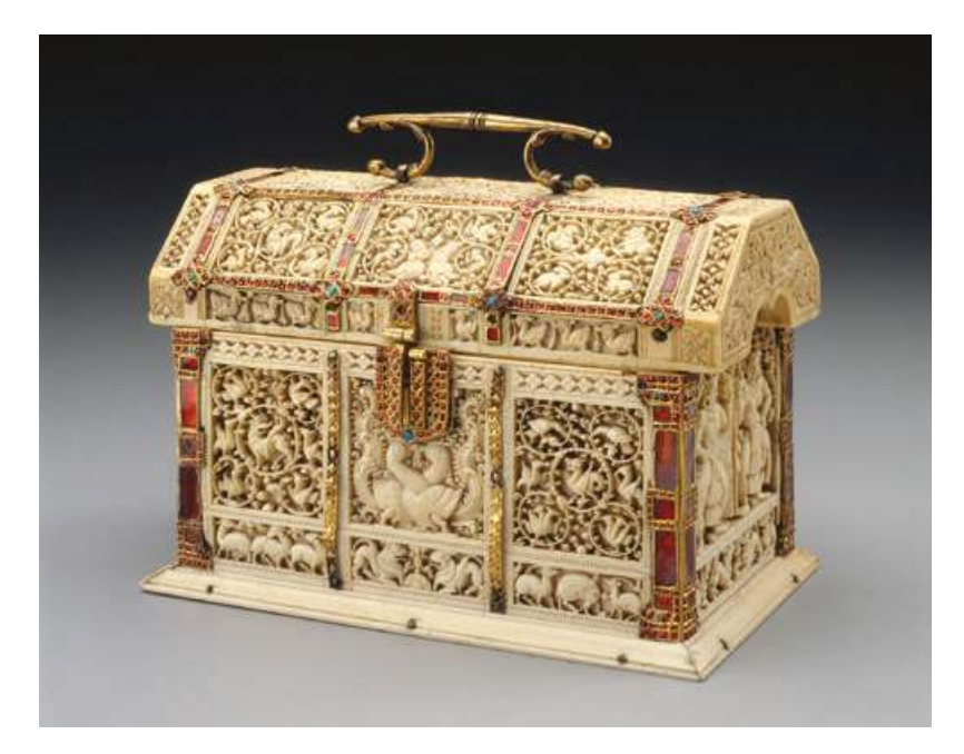
Fig. 6.4 Casket, front panel, Sri Lanka, mid- to late sixteenth century, Photograph © 2017 Museum of Fine Arts, Boston, Bequest of William A. Coolidge, Accession no. 1993.29.