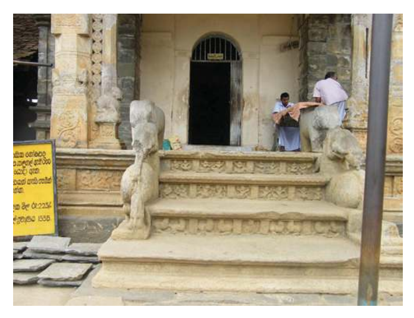
Fig. 6.9 Gaḍalādeṇiya Rājamahā Vihāraya, 1344 ce, author's photograph.