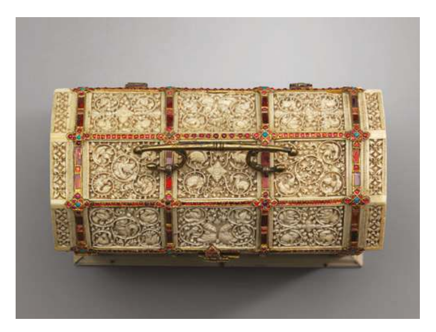
Fig. 6.15 Casket, lid, Sri Lanka, mid- to late sixteenth century, Photograph © 2017 Museum of Fine Arts, Boston, Bequest of William A. Coolidge, Accession no. 1993.29.

and a casket in a European private collection. In the last, as well as in one of the caskets in Vienna, this motif dominates every single panel.85 The carver of the casket in Boston, too, chose to use the motif on three faces of the lid (Figure 6.15) and on the main body (Figure 6.4 and Figure 6.16); however, in this case, the carver also decided not to use it in the large side niches at each end of the casket (Figure 6.8). In the other caskets, the motif is mostly visible on the lid: in the 'coronation casket' it appears on the topmost section of the lid (Figure 6.17); in the second casket in Munich the vine is also seen on the topmost portion of the lid; and similarly in the 'Rāmāyana casket' in Vienna and in the Peradeniya casket the motif is seen only in the uppermost portion of the lid. Using this motif to adorn the upper portions of caskets seems to have become a standard manner of ornamenting ivory caskets: by the fourteenth century, if not earlier, such auspicious vines with animal and human figures entwined within creepers appear on stone doorways of medieval temples (Figure 6.18); and indeed, the choice of ornamenting a lid with an auspicious motif does not seem surprising, as its function corresponds to that of a doorway.