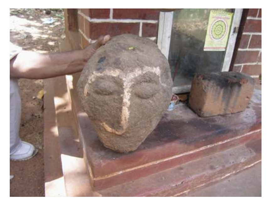
Fig. 1.8 Head from a Buddha image rededicated as an image of Ayanayake, Anurādhapura hinterland, authors' photograph.