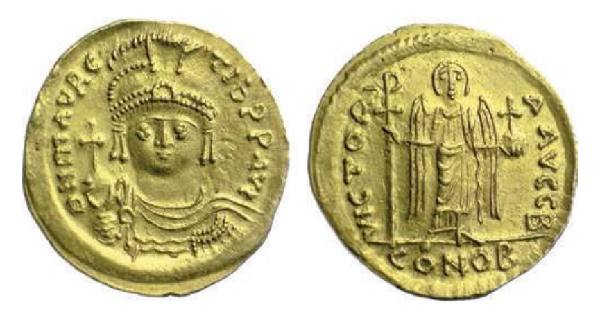
Fig. 2.3 Gold solidus of Maurice Tiberius, struck in Constantinople, Barber Institute of Fine Arts, B1767 (Whitting No. 518), 4.49 grams, die axis 7 o'clock, MIB 6E.<sup>64</sup>

VV07 (Figure 2.2) may be the same solidus of Anastasius recorded by Codrington as having been part of the de Saram collection. It is indeed struck in the name of Anastasius, and in 1924 Codrington's attribution of the coin to the mint of Constantinople on the basis of its mint mark, COMOB, may have accorded with his knowledge and observations. By 1955, when Whitting recorded the coin, however, he listed it, as current scholarly consensus holds, as a solidus of the Ostrogothic king of Italy, Theoderic I, minted in the name of Anastasius. Sixth-century gold coins struck anywhere in the Byzantine Empire usually carried the CONOB mark, standing for Constantinopoli obryziacus or 'fine gold of Constantinople', apparently as a guarantee of purity rather than location of minting. The COMOB variant has been linked to Italy. 62 This coin should, therefore, be considered a probable Italian issue, but it could have travelled from Italy to the eastern Mediterranean and thence to India or Sri Lanka, and coins of Anastasius are also known in South India, although none have yet been identified there with the COMOB mint mark.<sup>63</sup> It could, however, also have been bought by de Saram because of the interest value to a collector of its Italian connection. There is no way to determine the likelihood of this find having come from European purchase or South Asian discovery.