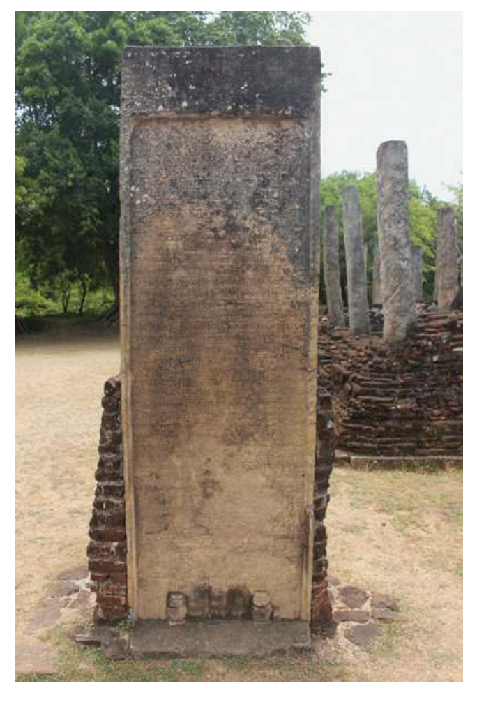
Fig. 1.1 Tamil inscription at the Atadage, Sacred Quadrangle, Polonnaruva.

(r. 1798–1815 ce), a Tamil/Telugu-speaker from a Hindu dynasty of South Asian origin. The attack on the Temple of Tooth by the LTTE in 1998 therefore not only resulted in damage to a monument constructed by a South Indian dynastic king from the Nāyaka dynasty, but also damaged adjacent shrines to Pattini and Viṣṇu, <sup>46</sup> important to both Buddhist and Hindu communities. The patronage and protection afforded by 'non-Buddhists' is further reinforced by a Tamil inscription on a stone slab beside the Tooth Relic Temple in Polonnaruva. Known as the Aṭadāgē, this structure was built under the patronage of Vijayabāhu I (r. 1055–1110 ce) and the epigraph instructs guards from South India, Vēlaikkāras, to protect the Buddha's Tooth Relic within<sup>47</sup> (Figure 1.1). Part of a long tradition of 'Sinhala'