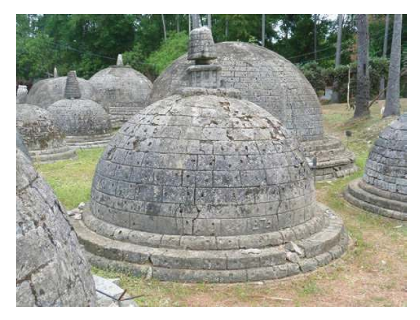
Fig. 1.4 Stūpas at Kantarodai, authors' photograph.

That such diversity existed elsewhere within the island is illustrated by the presence of the free-standing crystalline limestone Avalokiteśvara statues, ten metres tall and dating to the seventh century CE, close to a free-standing 14.5-metre high Buddha statue at Maligawila. Furthermore, at Buduruwagala a large rock carved image of the Buddha, dating to the ninth–tenth century CE stands alongside possible depictions of Tara, Avalokiteśvara, Vajrapāṇi holding a thunderbolt, Maitreya and either Viṣṇu or Sahāmpati Brahmā (Figure 1.5). Again, their co-existence demonstrates the variability and diversity of Buddhism and religious practice, as reflected though worship, patronage and architecture, within Sri Lanka. 141