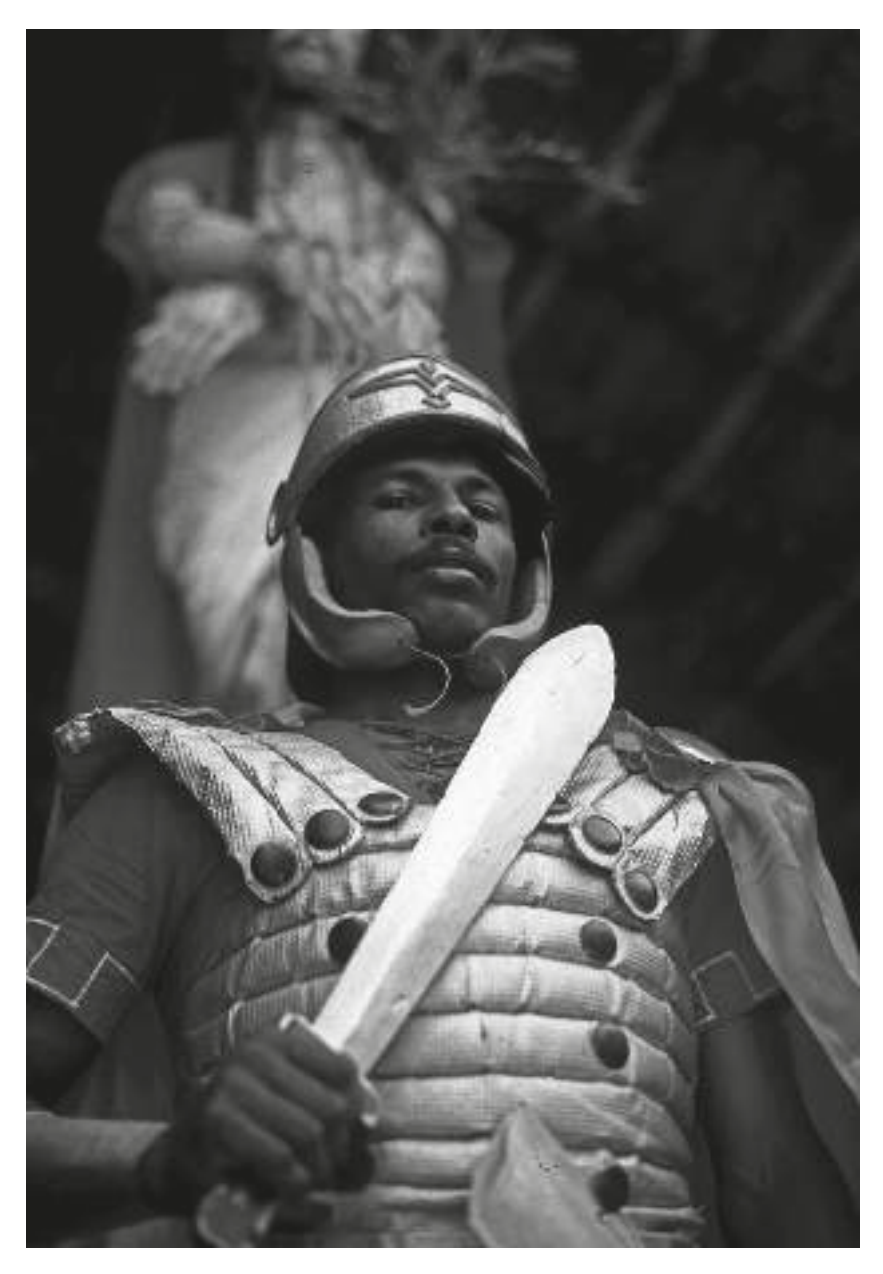
Fig. 0.1 A Sri Lankan Catholic dressed up as a Roman legionnaire at a Passion Play, Negombo, mid-1980s, photograph by Dominic Sansoni.