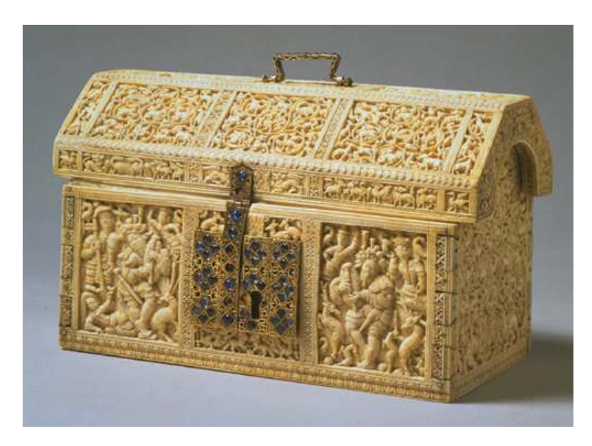
Fig. 6.2 'Robinson casket', Sri Lanka, probably Kōṭṭe, mid-sixteenth century, © Victoria and Albert Museum, London, Inventory no. IS.41-1980.