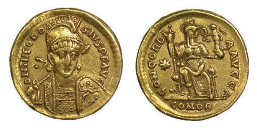
Fig. 2.1 Gold solidus of Theodosius II, minted in Constantinople, Barber Institute of Fine Arts, LR489 (Whitting No. G522), 3.82 grams, die axis 6 o'clock, RIC X, 202.<sup>56</sup>