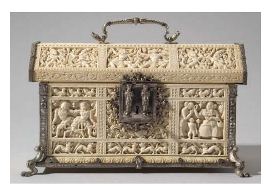
Fig. 6.1 'Rāmāyaṇa casket', front panel, Sri Lanka, mid-sixteenth century, KHM-Museumsverband, Wien, Inventory no. KK 4743.