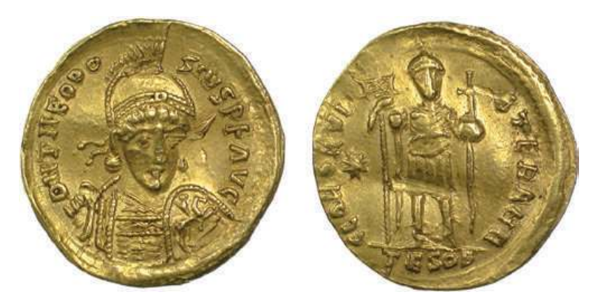
Fig. 2.5 Gold solidus of Theodosius II, struck in Thessaloniki, Barber Institute of Fine Arts, LR482 (Whitting No. G519), 4.42 grams, die axis 6 o'clock, RIC X, 361.

further west. Of all of the coins found in the Barber collection, therefore, this one, despite the Thessalonikan mint signature, seems the most likely to have a historical Lankan provenance.