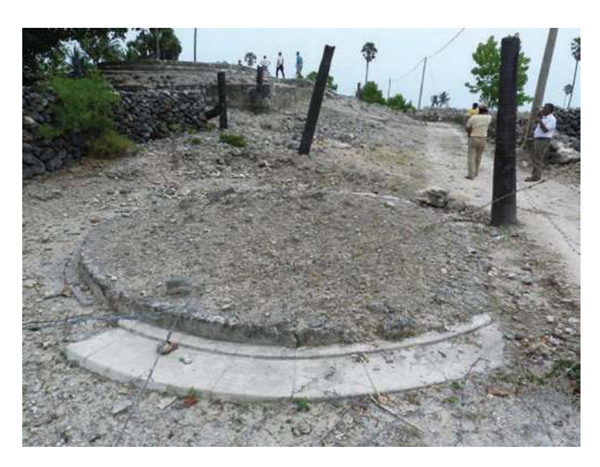
Fig. 1.3 Stūpas at Delft, authors' photograph.

At an individual level of analysis, scholars have also been able to identify significant areas of differentiation within chronologically contemporary schools of sculpture and image-making. In a study of six sculptures, based on lead isotope and trace element scatter plots, Arjuna Thantilage identified two distinct groups and interpreted them as representing two separate schools of image production within the Anurādhapura period, possibly representing different Mahāyāna fraternities. There are also architectural differences in stūpa construction across the island. While perhaps reflecting differences in patronage or access to distinct building materials, the brick and stone constructions of Anurādhapura and Polonnaruva, particularly the examples of 'Buddhist giganticism', <sup>139</sup> are in stark contrast to the coral and limestone stūpas in the Jaffna peninsula, as in the monastic complexes of Delft and Kantarodai<sup>140</sup> (Figures 1.3 and 1.4).