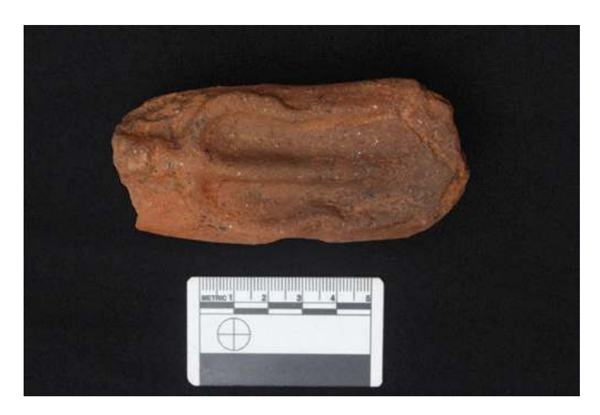
Fig. 1.7 Appliqué triśūla on a pottery rim sherd from site Kalahagala (S360) in the hinterland of Polonnaruva, found during the 2016 field season of the Polonnaruva Archaeological and Anthropological Research Project, authors' photograph.

Kevalamūrti and Nṛtyamūrti, and potentially Ardhanarīśvara, were recovered from a pillar foundation at Jetavana in the 1980s. 192 Furthermore, three appliqué ceramic sherds with symbols similar to those from the Alahana Pirivena were discovered in the later sequence of trench ASW2 at Anurādhapura, 193 as well as in the vicinity of Jetavana. 194 The later evidence at Anurādhapura is striking in its similarity to the evidence usually given for plurality of belief in Polonnaruva, and yet Anurādhapura, persistently presented as an essentially Buddhist capital, is generally not advanced as a similar example of religious plurality. The transmission of the capital from Anurādhapura to Polonnaruva has been projected as an abrupt and singular event, yet recent research has shown the abandonment of Anurādhapura and its hinterland to have been a slow process that happened over several centuries. 195 We would argue that around Polonnaruva there is likely to be evidence of much earlier settlements and communities that would shed more light on the nature of early medieval Sri Lanka. To this end, the Central Cultural Fund and British Academy have sponsored successful pilot hinterland surveys around Polonnaruva, as well as excavations at Siva Devale No.2 and the citadel's northern wall.