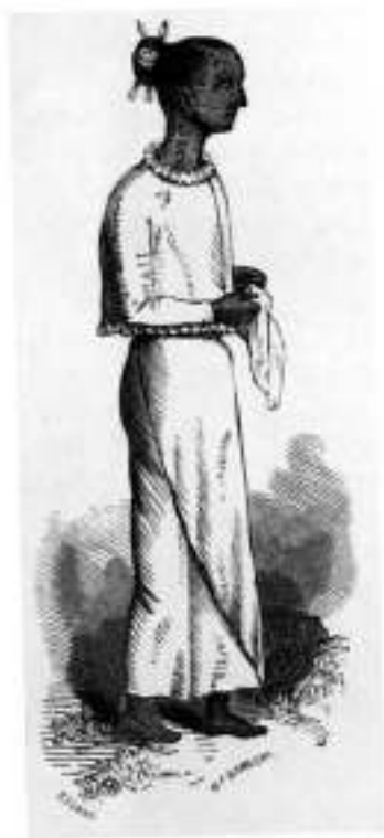
PROFILE OF CINGALESE WOMAN.