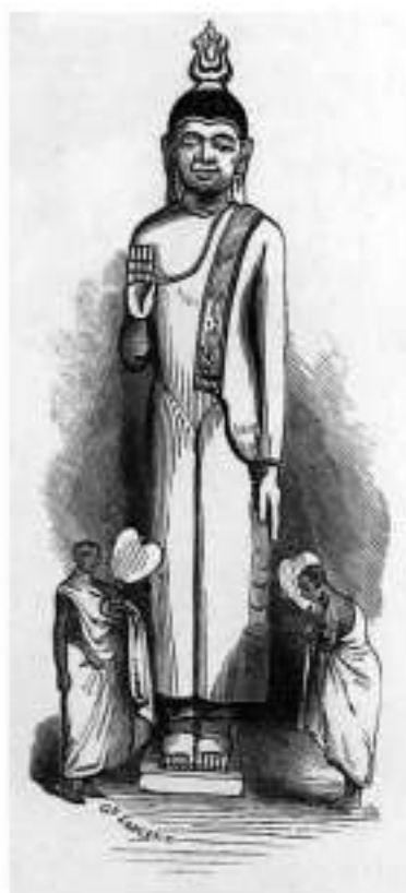
BUDDHA AND PRIESTS.