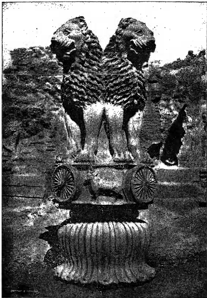
CAPITAL OF ASOKA COLUMN AT SARNATH