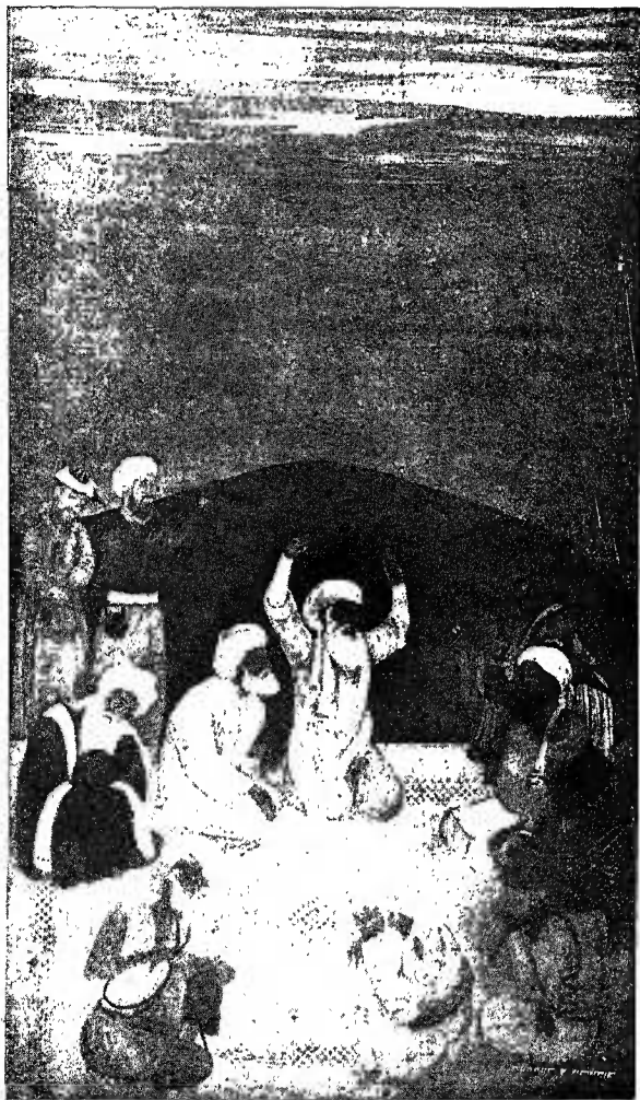
THE POET SADI LISTENING TO A SINGER.