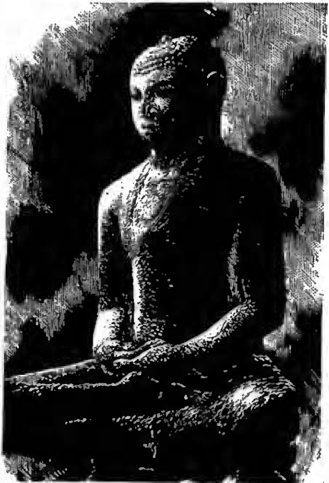
GOTAMA THE BUDDHA