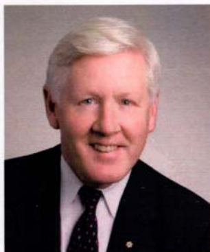
The Honourable Bob Rae, P.C., O.C., M.P. 2012

On behalf of the Liberal Party of Canada and our Parliamentary Caucus, please accept my best wishes for tonight's celebration.