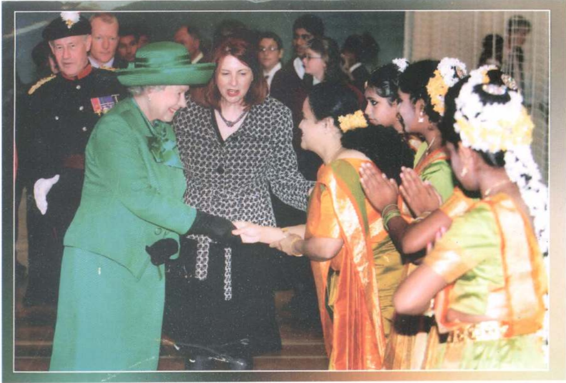
ஒலிம்பிக் நிகழ்ச்சியின்போது மகா ராணியாரால் பாராட்டப்பட்டபோது