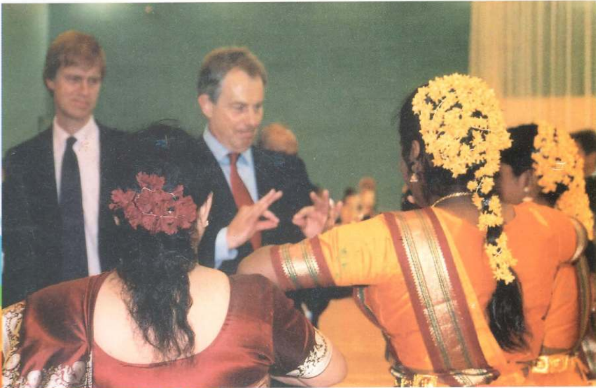
ஒலிம்பிக் நிகழ்ச்சியின் போது பிரதமரும் NewHam MP யும்