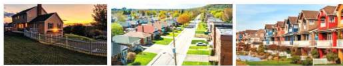
Real Estate page compiled by Charles Devasagayam