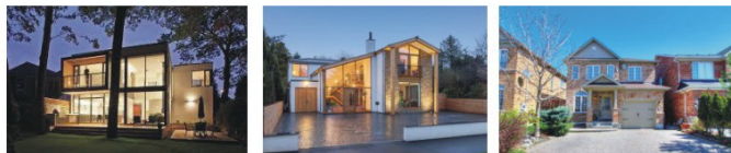
Real Estate page compiled by Charles Devasagayam